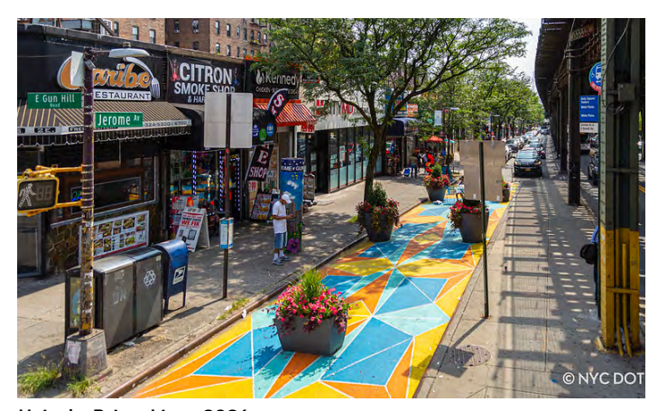
Unity by Britny Lizet, 2021. Pedestrian Plaza, Intersection of Jerome Avenue and East Gun Hill Road, Bronx.