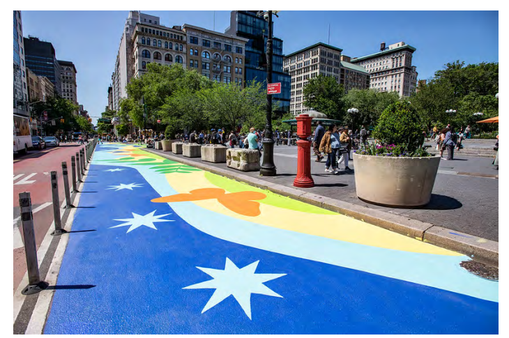
Union with the Universe by Vanesa Álvarez, 2023. 14th Street Busway, Manhattan.