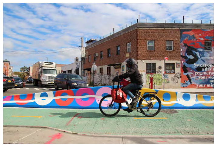
Chromatic Circles by Otra Ciudad, 2020. Franklin\,Street\,between\,Quay\,Street\,and\,North\,14th\,Street, Brooklyn.