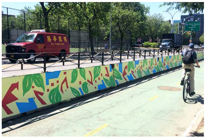
Caribbean Breeze, by Marie-Saint-Cyr, 2021. Columbia Street between Atlantic Avenue and Congress Street, Brooklyn.