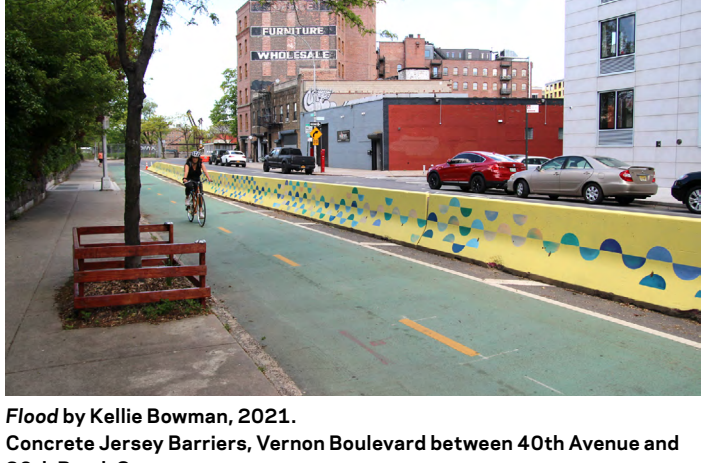
30th Road, Queens.