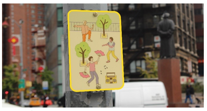
Example of past signage installed on a streetlight pole near Kimlau Square