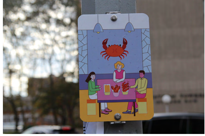
Welcome to Chinatown - Chinatown Walk by Dingding Hu, 2017. Pearl Street, Manhattan.