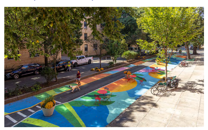
The Sun Also Rises by Priscila De Carvalho, 2023. 34th Avenue Paseo Park Open Street between 89th Street and 90th Street, Queens.