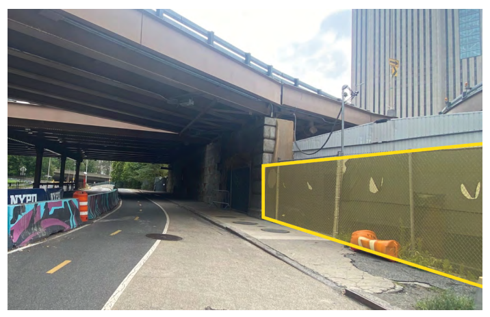
Existing fence on Park Row