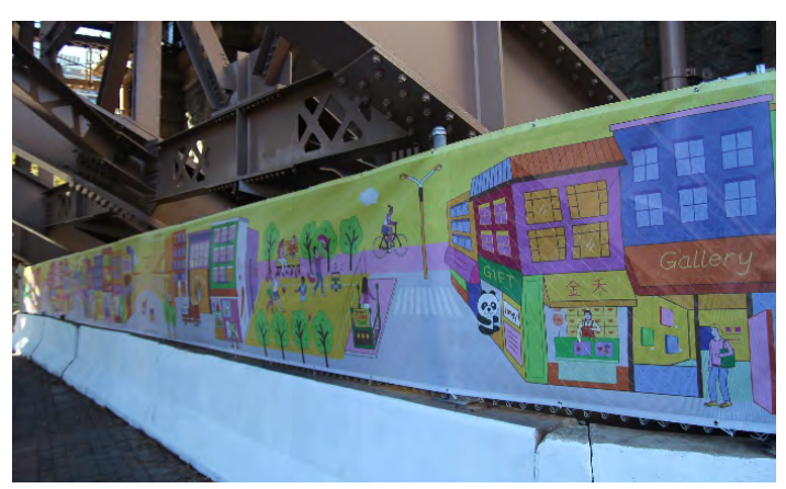
Welcome to Chinatown - Chinatown Walk by Dingding Hu, 2017.