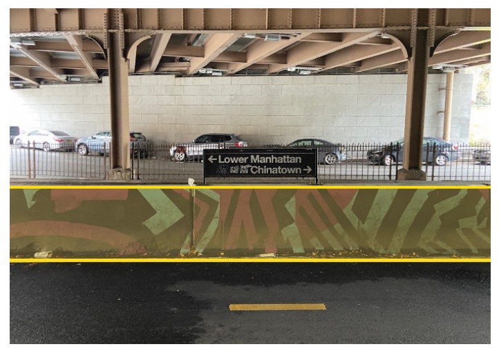
Existing concrete barrier on Park Row