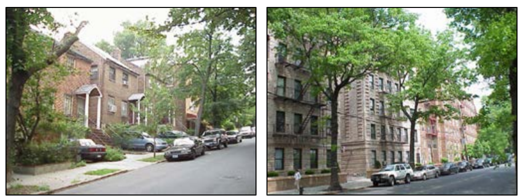
Proposed R4A on west side of Cannon Place north of West 238th Street

Recognizing this disparity between the existing built environment and what is permitted under current zoning, the community has raised concerns about the impacts of potential overdevelopment on neighborhood schools, parking, and social services. In its 197-a plan, the Community Board has therefore recommended rezoning the area to lower and mid-density contextual districts, which would maintain the unique character of this community.