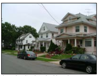
Low density detached housing on 195th Street at 100th Avenue