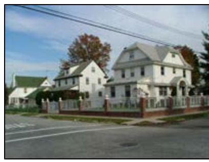
Avenue in the proposed R2 zoning district

In the proposed R2 zoning district, residential development would be limited to one-family, detached homes with a maximum 0.5 FAR. The minimum lot size and lot width requirements would be 3,800 square feet and 40 feet for any new residential development. The minimum front yard Typical detached houses on Lewiston depth would be 15 feet. Maximum building height would be controlled by a sky exposure plane.