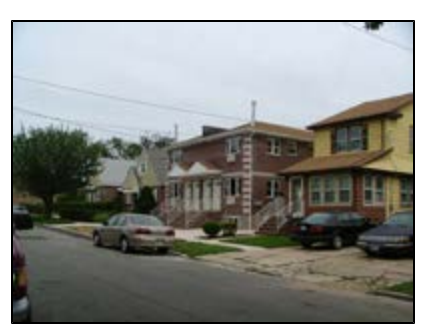
Out-of –character semi detached twofamily homes on 196th Street in an existing R3-2 district