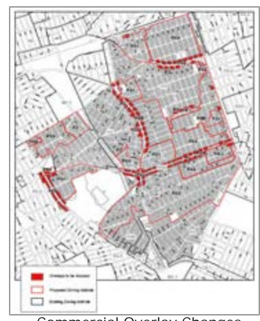
Commercial Overlay Changes View a Larger Image

8 block fronts along Merrick Boulevard between Foch Boulevard and Linden Boulevard.