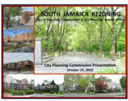
View the slideshow presentation

• Medium-density Contextual Rezoning: Zoning map amendment for all or portions of 108 blocks from R3-2, R3A, R4, R4B and C8-1 districts to R5, R5B and R5D districts to reflect existing building and land use patterns and to allow for moderate-density increases along the area's wide streets.