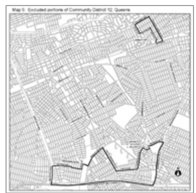
Boundaries of FRESH Excluded areas in Queens Community District