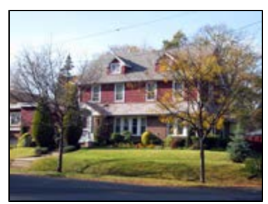
Detached building on Southgate Plaza and Bennett Street in proposed R2 district

The R2 district permits only single-family, detached residences on lots that have a minimum area of 3,800 square feet and a minimum lot width of 40 feet. The maximum floor area ratio (FAR) is 0.5. There is no maximum building height; instead, the building's maximum height is determined by its sky exposure plane , which has a varying height depending on where the building is located on its raping lot.