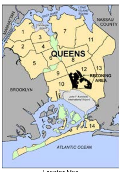
Locator Map <u>View a larger image</u>

The rezoning area encompasses South Jamaica and extends into portions of the Springfield Gardens and St. Albans communities, and is generally bounded by Liberty Avenue, 108th Avenue and South Road to the north; Merrick and Springfield Boulevards to the east; the North Conduit to the south; and the Van Wyck Expressway to the west.