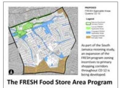
Existing and Proposed FRESH Applicable areas in Queens Community District 12 🤼 <u>View a larger image</u>

The text amendment also proposes accessory parking requirements to be the same as other retail uses. This would require a parking rate of 1 space 300 square feet of floor area in C1-2, C2-2, C4-2, C8-1 and M1-1 districts; and 1 space per 400 square feet of floor area in C1-3 and C2-3 districts. Parking requirements in M1-4 districts and C1-4 districts would remain unchanged.