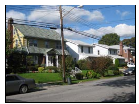
Single-family homes on Southgate Street south of 137th Avenue in an existing R3-2 district

Most of the buildings within the rezoning area consist of 1- and 2-family detached houses with small concentrations of 1- and 2-family semi-detached and attached houses. Over the last several years, South Jamaica and its neighboring communities have experienced development pressure largely due to its outdated zoning which has remained unchanged since 1961. The area's existing R3-2 and R4 zoning districts allow a variety of housing types and densities that are inconsistent with the prevailing scale and built character of South Jamaica's neighborhoods.