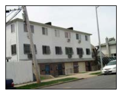
Attached homes on Mars Place between Farmer's Boulevard and Eveleth Road in proposed R3-2 district

The R3-2 district is the lowest-density general residence district in which multi-family structures are permitted. A variety of housing types are permitted including garden apartments, row houses, semi-detached and detached houses. The maximum FAR is 0.6, which includes a 0.1 <a href="https://doi.org/10.10/10/10/2016/">https://doi.org/10.10/2016/</a> Minimum lot width and lot area depend upon the housing configuration: detached residences require a 40-foot lot width and 3,800 square feet of lot area; other housing types require lots that have at least 18