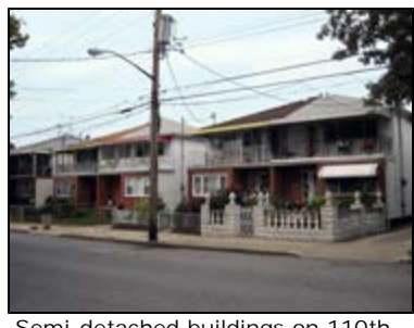
Semi-detached buildings on 110th Avenue between 143rd and Inwood Streets in proposed R4-1 district

The R4-1 district permits one- and two-family detached or semi-detached residences. The maximum FAR is 0.9, which includes a 0.15 attic allowance. The minimum lot width and lot area depend upon the housing type: detached residences require a minimum 25-foot lot width and 2,375 square feet of lot area. Semi-detached residences require a minimum 18-foot lot width and 1,700 square feet of lot area. The maximum building height is 35 feet, with a