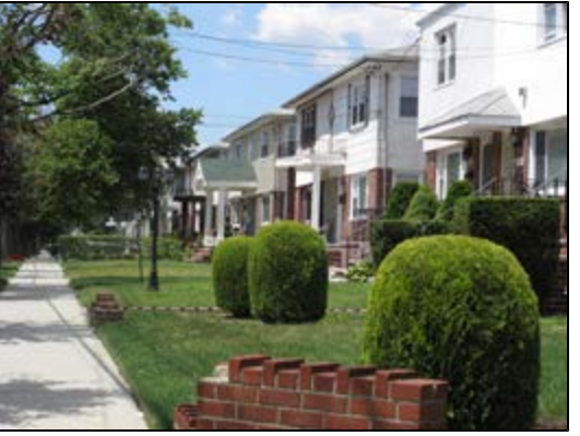
One- and two-family houses on 149th Avenue in an existing R3-2 district