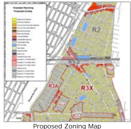
View a larger image

The proposed Zoning Map amendments will replace all or portions of the existing R3-2 zoning district with R2, R3A, R3X or R3-1 districts. In addition, most of the C1-2 and C2-1 overlay districts will be replaced with C1-3 or C2-3 districts. Certain 2-1 and C1-1 overlay districts will be eliminated or reduced where residential or community facility uses exist and a new C1-2 overlay district is proposed to be mapped where commercial uses exist.