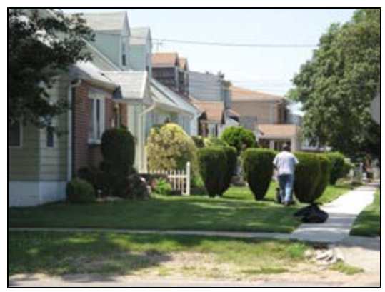
Single-family homes on 256th Street in an existing R3-2 district