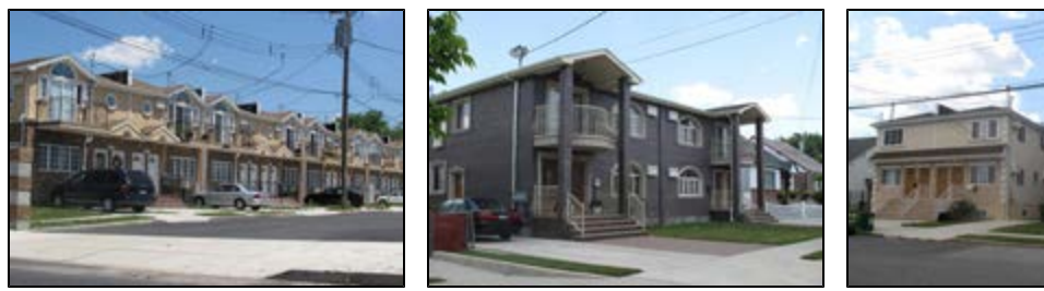
Out of character row houses on Hook Creek Boulevard in an existing R3-2 District

C1-1, C1-2 and C2-1 commercial overlay districts are mapped within existing residential districts along primary thoroughfares, including Hook Creek Boulevard, Merrick Boulevard, Francis Lewis Boulevard, South Conduit Avenue and 243rd Street. C1-1 and C1-2 districts allow Use Group 6 commercial establishments, which include uses that serve local retail needs (e.g. grocery stores, restaurants). C2-1 districts include a wider range of retail and service establishments in Use Groups 5 through 9 and 14 (e.g. repair services, catering halls, funeral homes). Maximum commercial floor area can reach 1.0 FAR with commercial uses limited to the first floor in mixed-use buildings. In C1-1 and C2-1 overlay districts, most retail uses require one accessory parking space per 150 square feet of commercial floor space, though these requirements may range between one space per 100 square feet of commercial floor area though the requirements may range between one space per 300 square feet of commercial floor area though the requirements may range between one space per 200 square feet of commercial floor area.