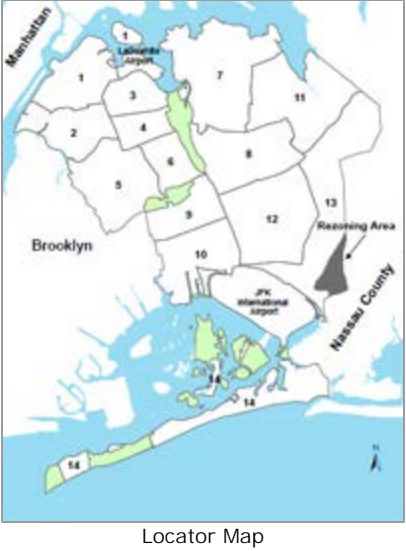
🌁 <u>View a larger image</u>

Rosedale is characterized as a piece of suburbia in the city. Located approximately 16 miles from Manhattan, the neighborhood is composed of predominately oneand two-family homes on tree-lined streets with some residences having waterfront access for boating on Hook Creek. The area is served by the Long Island Rail Road at Rosedale station and is easily accessible to arterial highways, such as the Belt and Laurelton Parkways. Large open space resources adjacent to the neighborhood include Brookville Park to the west and Idlewild Park to the south.