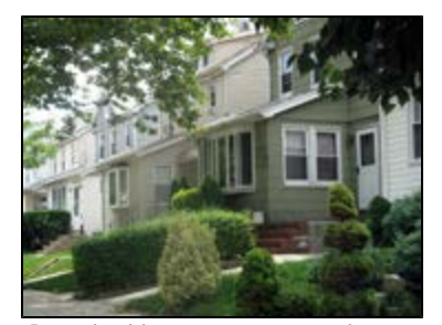
Detached houses on narrow lots on Huxley Street in a proposed R3A district

R3A zoning allows one- or two-family detached houses with a maximum FAR of 0.6, which includes a 0.1 attic allowance. R3A districts require a minimum lot width of 25 feet and a minimum lot area of 2,375 square feet. In addition to the 10-foot minimum front yard requirement, a deeper front yard would be required to match the yard depth of an adjacent building up to 20 feet. The maximum building height is 35 feet, with a maximum perimeter wall height of 21 feet. One parking space is required for each dwelling unit.