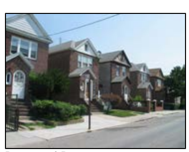
Proposed R4-1 60th Avenue between Lawrence and 136th Street

While R4 districts permit all types of residences, including multifamily apartment buildings, new development in the proposed R4-1 zoning district would be limited to one- and two-family detached and semi-detached houses. The minimum lot size and lot width requirements would be 2,375 square feet and 25 feet for detached homes and 1,700 square feet and 18 feet for semi-detached residences. The maximum FAR would be 0.9, which includes a 0.15 attic allowance. The maximum building height would be 35 feet and the maximum perimeter wall height would be 25 feet. The front yards of new homes must be at least 10 feet deep or at least as deep as an adjacent yard up to a depth of 20 feet.