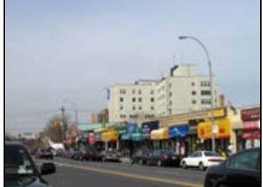
Retail along Main Street with view of the New York Hospital Queens