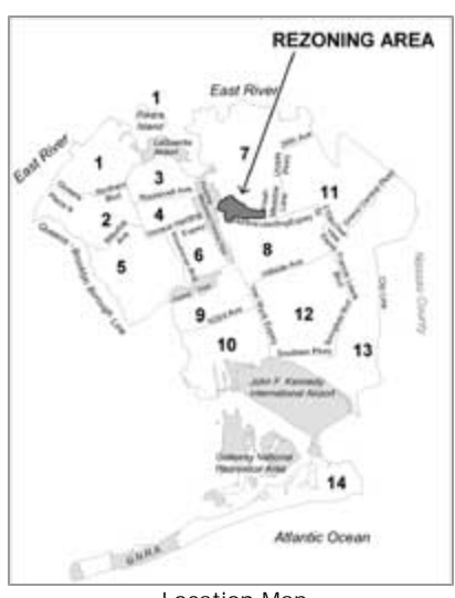
Location Map Niew a larger image.

In response to community concerns that recent development has been inconsistent with neighborhood scale and character, the proposed rezoning was undertaken in close consultation with Community Boards 7 and 8, elected representatives, as well as civic associations, including the Queensboro Hill, Flushing-on-the-Hill, Kissena Heights, and Cedar Grove civic associations.