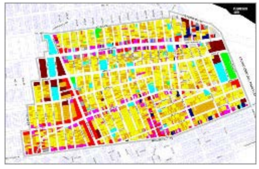
Land Use Map North Corona

The North Corona rezoning is bounded by 32nd Avenue / Astoria Boulevard on the north, 114th Street on the east, Roosevelt Avenue on the south, and on the west, the boundary is defined by a stepped line of north - south running streets beginning at 89th Street at Roosevelt Avenue and ending at the intersection of 93rd Street at 32nd Avenue.