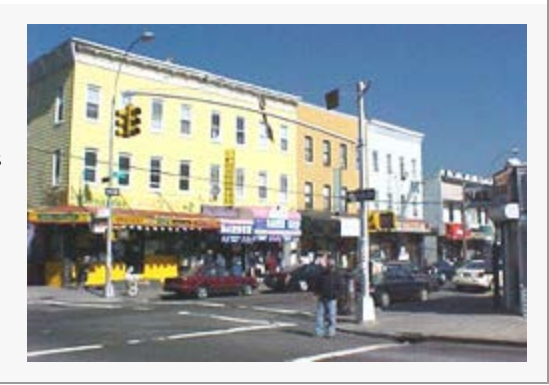
Image: Existing mixed-use (retail and residential) on 37th Avenue. Overlay district added to reflect development patterns.

The former commercial overlay districts did not reflect actual patterns of street-level retail uses. The rezoning increases the number of overlay districts, but reduces their depth to prevent retail uses from spilling over onto residential streets.