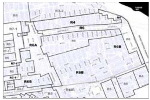
Adopted Zoning Map North Corona

<u>Contextual zoning</u> designations, which regulate new developments to more closely reflect the scale of surrounding buildings, replace most of the former residential zoning south of Northern Boulevard. Other zoning districts - R4, R5 and R6 - that allow a variety of housing types are either retained in locations where they match the existing residential scale, or newly designated where an increase in bulk, scale and height would be appropriate.