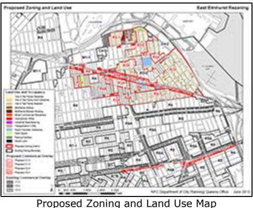
roposed Zoning and Land Use Ma

The proposed <u>contextual zoning</u> strategy will protect the character of residential blocks and ensure future residential development is predictable and consistent with surrounding neighborhood built contexts. The proposed zoning along Astoria Boulevard, along with new C1-3 and C2-3 commercial overlay zones, will support moderate density, mixed-use development that could reinforce its street-wall continuity and strengthen its neighborhood "shopping street" character. Updates to commercial overlay zones would more closely match established land use