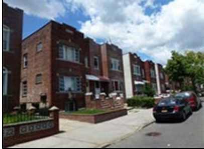
One- and two-family semi-detached houses on 99th Street within the proposed R4-1 district

The R4-1 district allows one- and two-family detached or semi-detached residences. The maximum FAR is 0.9, which includes a 0.15 attic allowance. The minimum lot width and lot area depend upon the housing type: Detached residences require a minimum 25- foot lot width and 2,375 square feet of lot area. Semi-detached residences require a minimum 18-foot lot width and 1,700 square feet of lot area. The maximum building height is 35 feet, with a maximum perimeter wall height of 25 feet. Community facilities are permitted at a maximum FAR of 2.0. One parking space is required for each dwelling unit.