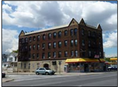
Apartment building on Astoria Boulevard within the proposed R6B district

We with the commercial overlay comparison chart.