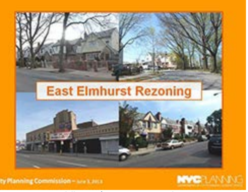
<u>View the presentation</u>