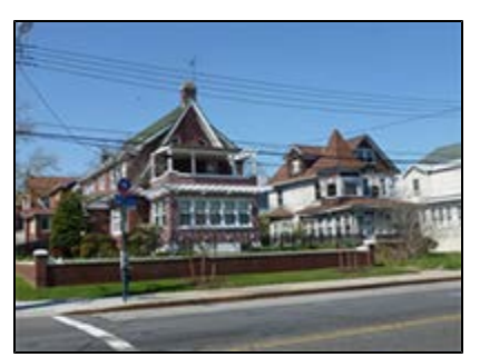
One and two-family detached houses on Ditmars Boulevard within the proposed R3X district

The R3X district allows one- and two-family detached residences on lots that have a minimum area of 3,325 square feet and a minimum lot width of 35 feet. The maximum FAR is 0.6 which includes a 0.1 FAR attic allowance. The maximum building height is 35 feet, with a maximum perimeter wall height of 21 feet. The front yard of a new building mustbe at least as deep as an adjacent front yard with a minimum depth of 10 feet and a maximum depth of 20 feet. Community facilities are permitted at a maximum 1.0 FAR. One parking space is required for each dwelling unit.