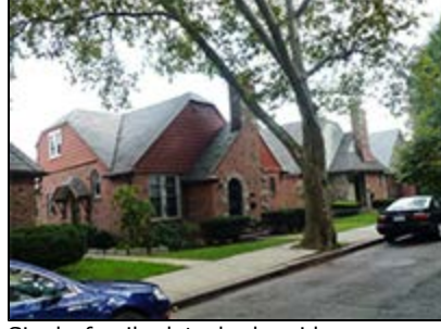
Single-family detached residence on 90th Street within the proposed R2A district

The R2A district permits only single-family, detached residences on lots that have a minimum area of 3,800 square feet and a minimum lot width of 40 feet. The maximum floor area is 0.5 FAR. The maximum building height is 35 feet, with a maximum perimeter wall height of 21 feet. The front yard must be at least 15 deep and match the depth of an adjacent front yard up to 20 feet deep. Community facilities are permitted at 0.5 FAR and up to 1.0 FAR by special permit. One parking space is required.