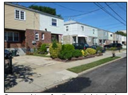
One- and two- family semi-detached houses on 101st Street within the proposed R3-1 district

The R3-1 district allows one- and two-family detached or semi-detached residences. The maximum FAR is 0.6, which includes a 0.1 attic allowance. The minimum lot width and lot area depend upon the housing configuration: detached residences require a minimum 40-foot lot width and 3,800 square feet of lot area; semi-detached residences require at least 18 feet of width and 1,700 square feet of lot area. The maximum building height is 35 feet, with a maximum perimeter wall height of 21 feet. The minimum front yard depth is 15 feet. Community facilities are