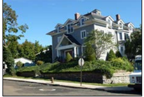
Detached two-family house on Butler Street and 31st Avenue within an existing R3-2 district