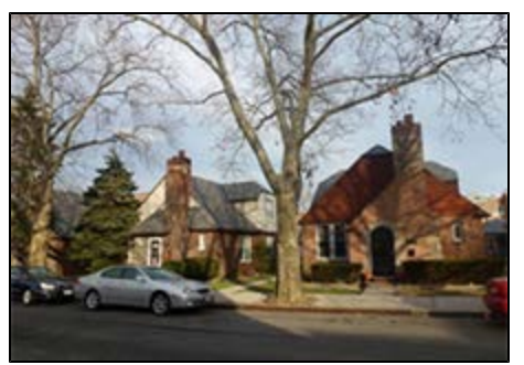
Detached one-family houses on 91st Street and 30th Avenue within an existing R4 district

Roosevelt Avenue between Elmhurst Avenue and 114th Street are zoned R5, R6 and R6B, but do not have commercial overlay districts that closely match existing land use patterns.