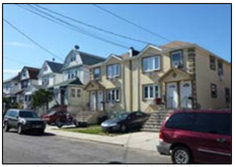
Out-of-character semi-detached buildings on Ericsson Street within an existing R3-2 district