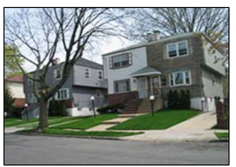
Semi-detached one-and two-family houses on 100th Street and 24th Avenue within an exsiting R3-2 district