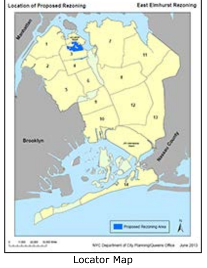
View a larger image

The proposed rezoning was developed in close consultation with community boards 3 and 4, the Queens Borough President, local elected officials and area residents, and it responds to their concerns that the area's existing zoning does not closely reflect established building patterns or guide development to appropriate locations. This rezoning is intended to protect the one- and twofamily character typically found on East Elmhurst's residential blocks while directing new residential and mixed-use development to locations along the rezoning area's main shopping corridors and near transit resources.