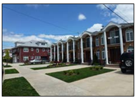
Out-of-character attached buildings along Ditmars Boulevard within an existing R3-2 district