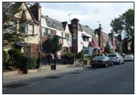
Attached one-family houses with rear parking on 90th Street and 30th Avenue within an existing R4 district