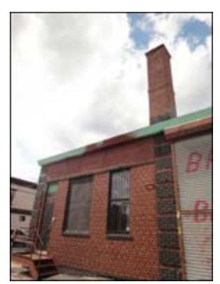
An (E) for air quality could require developments adjacent to an emissions source to use non-operable windows

ZR Section 11-15 contains outdated provisions and many Special District chapters contain regulations that would be duplicative of the language in the proposed amended Section 11-15. This text amendment would remove duplicative provisions and obsolete language, clarifying existing regulations.