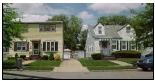
Typical single-family development in the proposed R-2 District