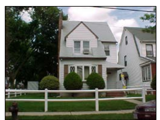
Typical development in proposed R3A District near 87th Avenue.