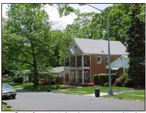
Out-of-context development permitted under existing R3-2 zoning