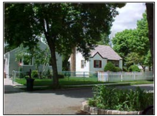
Single-family homes on large lots in the proposed R2 District.