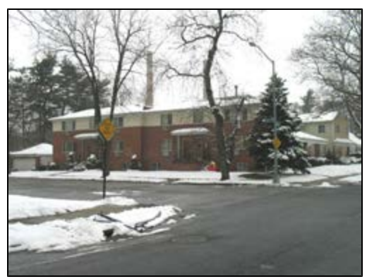
Multi-family, semi-detached structure constructed under the existing zoning.