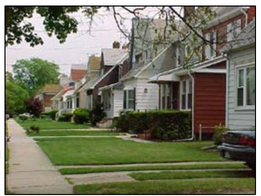
Typical homes and streetscape in the proposed R3A District.

The zoning changes are the result of a study undertaken by DCP at the request of the community, the Borough President's Zoning Task Force and the local council member. The proposals respond to community concerns about the changes in their neighborhood brought about by as-of-right construction of multi-family houses. Under the existing R3-2 zoning which permits all types of housing including row houses and apartment buildings, detached one-family homes have been demolished and replaced with semi-detached, two-family or multifamily structures.