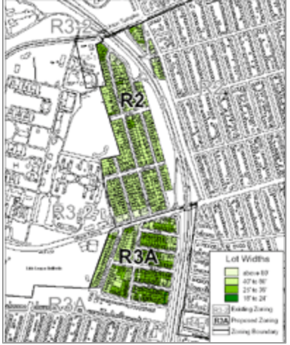
Proposed Zoning and Lot Widths