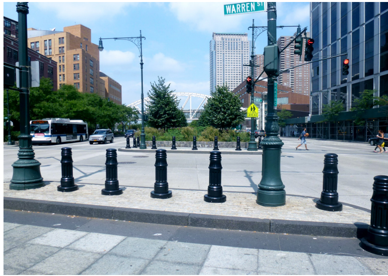
FIGURE 10 | DOT traffic-calming measures have helped improve the pedestrian experience, as shown here at the Hub in the Bronx (Left). At the West Side Highway and Warren Street in Lower Manhattan. (Right)