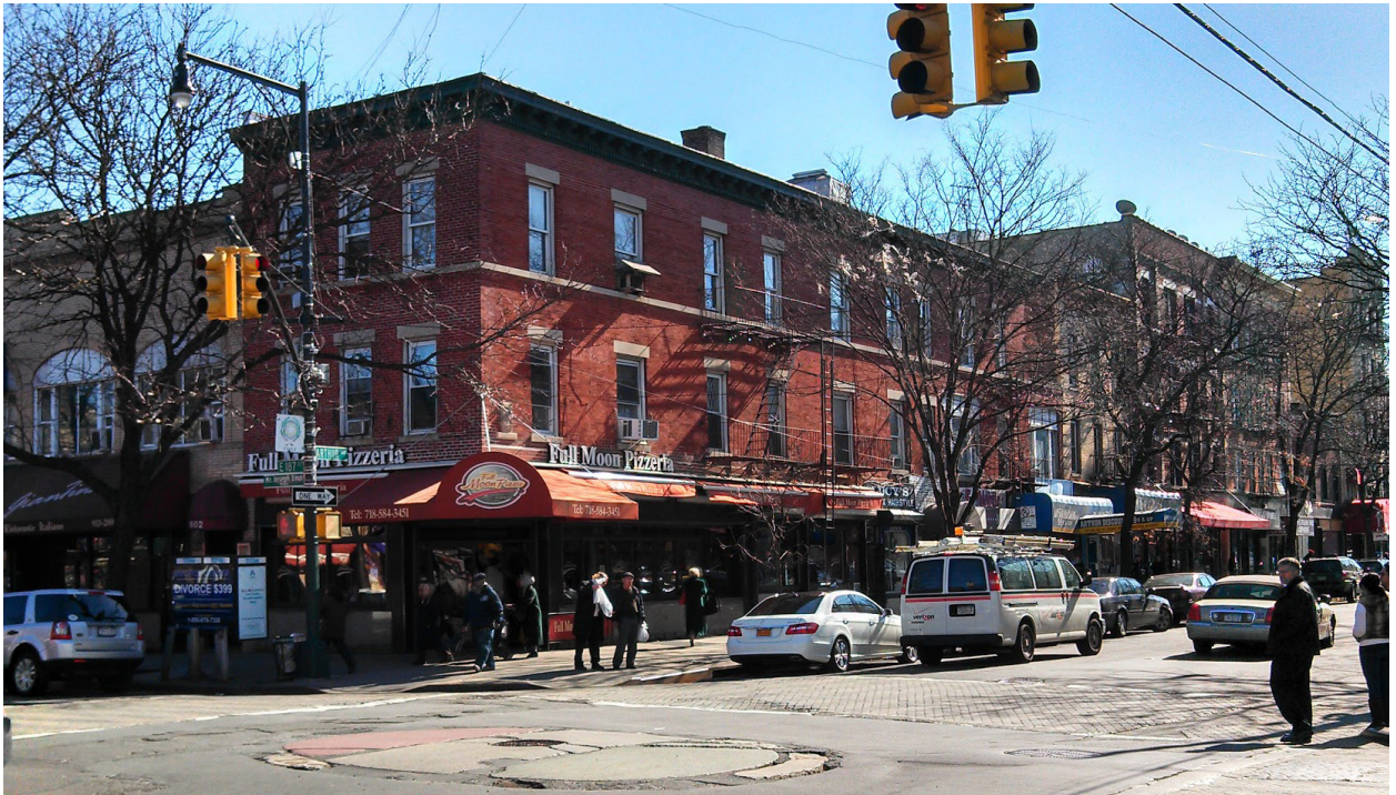
FIGURE 3 | Street blocks in the Melrose neighborhood, Bronx. (Top) 161st Street and Concourse Village East. Surface parking abuts the pedestrian realm, creating a break in the street wall. (Bottom) Arthur Avenue, Belmont. This successful retail corridor has a diversity of ground floor uses, street trees, continuous street wall, and contextual buildings.

tains active retail along the ground floor, street trees, continuous street wall, contextual building that also have varying articulation and nuances. The contrasting images illustrate how a block with an unsuccessful streetscape, in the case of 161st street, can serve as a barrier to pedestrian activity. The Melrose section of this report further details how integral this is to a thriving retail corridor.