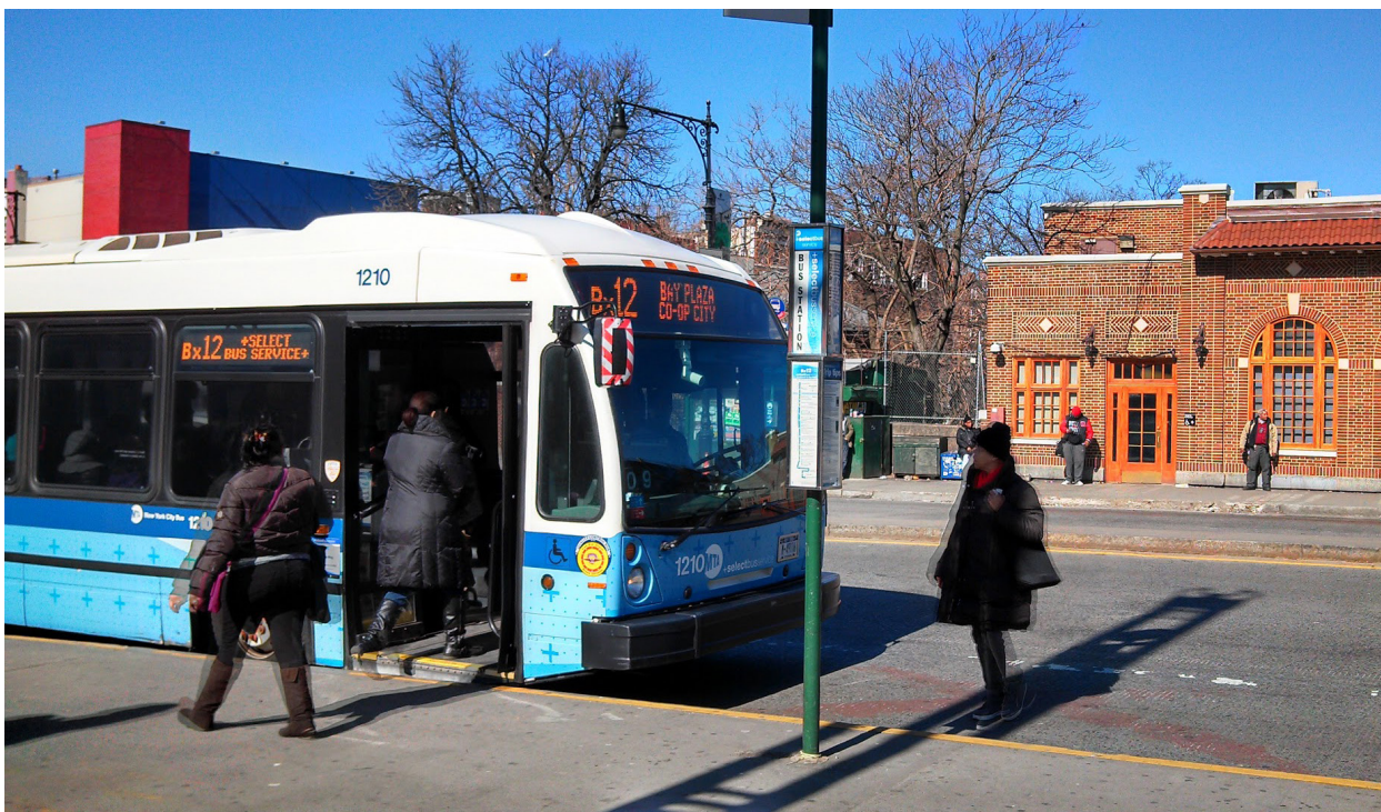
FIGURE 4 | Bus stop near the Fordham Metro-North Station. Easing transfers between different modes helps create a more comprehensive public transit system, and, in turn, supports the growing reverse-commute pattern in the Bronx.

Building façades not only have the challenge of being attractive and well-designed at the building scale, but should also work to be relatively harmonious with other buildings on the block. Attention should be paid to how much a building entrance is setback from the street, how high it rises, and what is the overall height of buildings. Ideally, a series