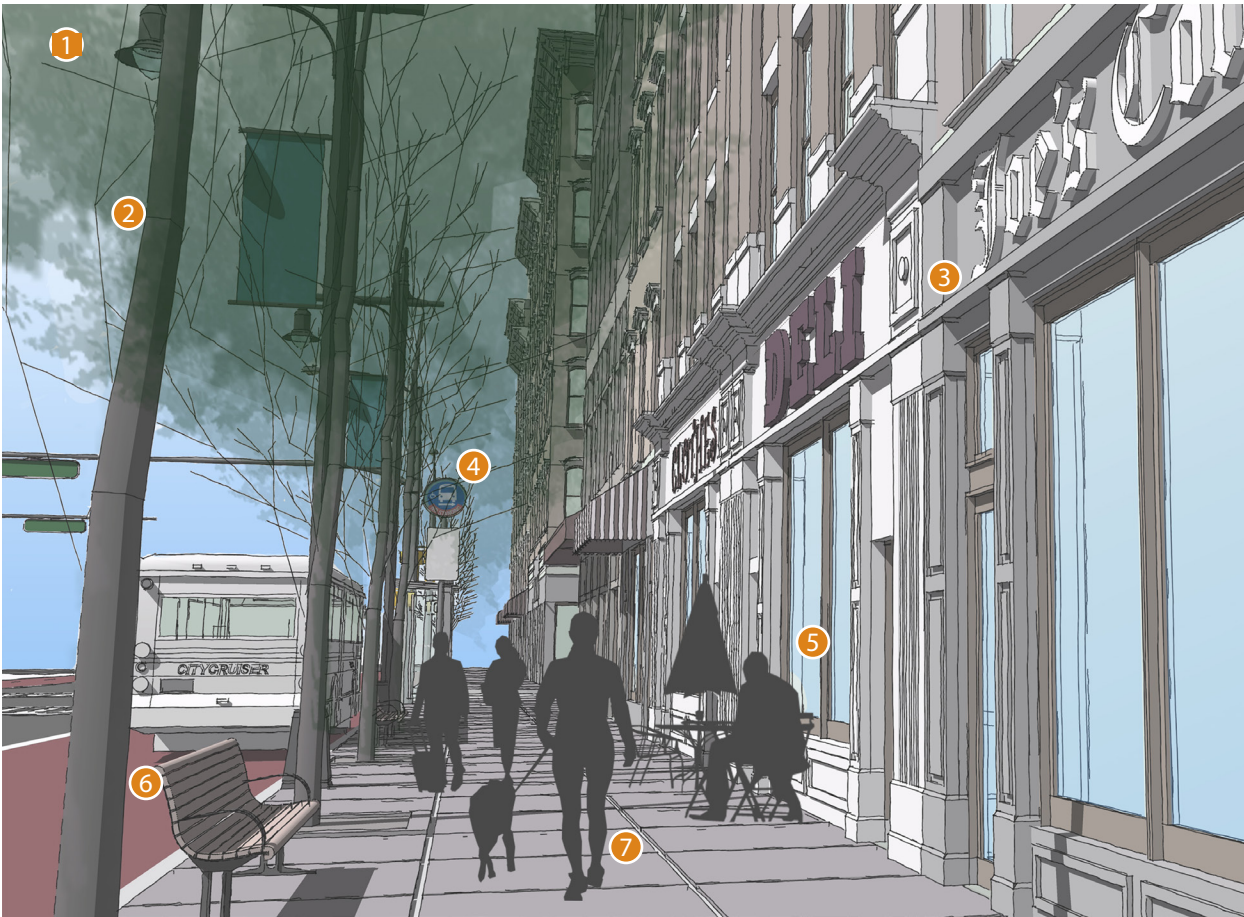
FIGURE 6 | Attributes of successful pedestrian streets.