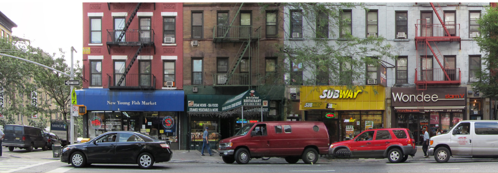
FIGURE 1 | East side of Amsterdam Avenue between 107th and 108th Streets in Manhattan. This highly walkable street contains active retail along the ground floor, street trees, continuous street wall, contextual buildings that also have varying articulation and nuances.

This section discusses the barriers to walkability currently faced by many Bronx neighborhoods, and discusses the components which are often found in the City's most walkable streets. When these components are comprehensively applied to major corridors, in a unique and compelling manner, they can facilitate a more walkable, more sustainable community which marries its transit assets into the pedestrian fabric.