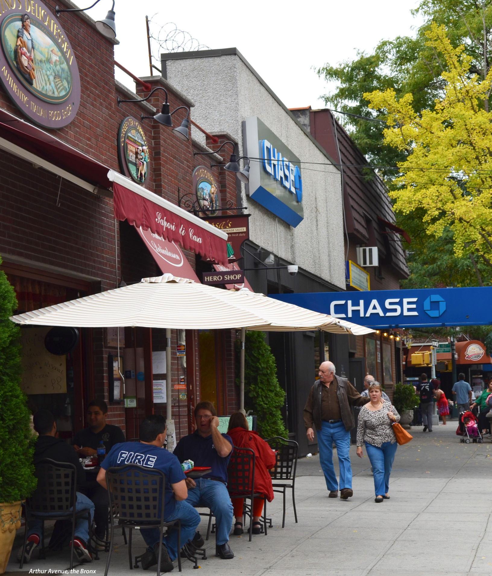
Arthur Avenue, the Bronx