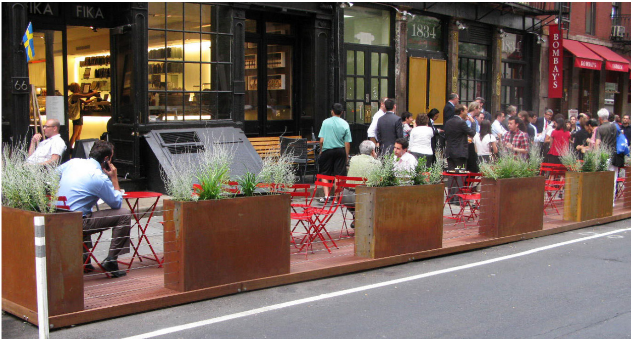
FIGURE 7 | Pop-up cafe on Pearl Street in downtown Manhattan.