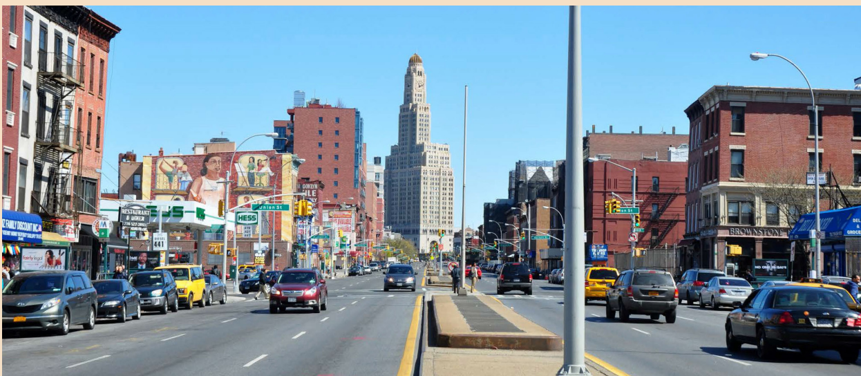
FIGURE 2 | Fourth Avenue, Brooklyn; the first EC District was established here in 2011.

In the Upper West Side in Manhattan, the city devised two distinct EC Districts in 2012 to address community concerns about changes to the retail landscape and character of the neighborhood. The Upper West Side, a highly dense residential area with limited commercial space, requires retail diversity to serve the needs of its large population. In order to address the unique conditions of the particular commercial avenues, the modifications to Amsterdam and Columbus differed from those on Broadway. The EC District along Amsterdam and Columbus Avenues addressed concerns about large frontages that have opened along the commercial avenues. Here, regulations which establish maximum frontage widths and minimum number of stores per block will help to ensure that the diverse array of storefronts is maintained in this area. Along Broadway, the commercial stores are of a regional character, and restrictions are specifically targeted to stem the proliferation of banks along the corridor. Both corridors utilize minimum levels of ground floor level transparency. These rules will ensure future growth mimics the rich urban fabric which has evolved in these neighborhoods.