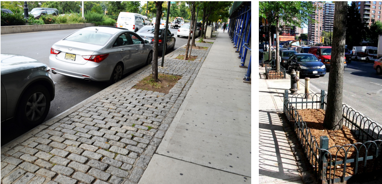
FIGURE 8 | Pervious pavers can be used to connect street tree pits in areas with heavy pedestrian traffic. (Left) Grand Concourse north of 161st Street, Bronx. (Right) Decorative tree guards add visual interest and protect street trees.

Examples of this success can be seen in the Bronx at the River Plaza and Bronx Terminal developments, as well as along Fordham Road, where large retail developments are often located on the second floor and basement. In order to maximize the potential value these stores add to a neighborhood and minimize the potential negative effects, additional controls can be established. An increased commercial floor area ratio (FAR) may encourage these stores to be located on second stories, allowing for an array of retail sizes to be retained on the ground floor. Lower parking requirements and screening requirements can minimize concerns over traffic congestion and strip malls. Finally, in small-scaled neighborhoods with a well-established variety of retail sizes, maximum store widths can protect this neighborhood character by shepherding large portions of these stores to the second floor, the basement, or behind other retail uses to minimize their impact.