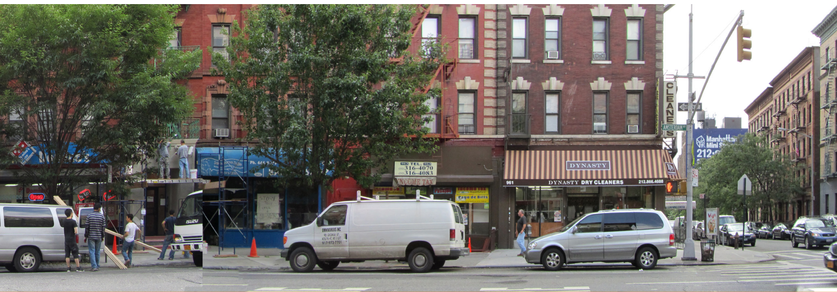
Figure 3 shows images of contrasting streets blocks. The block along 161st in the Melrose neighborhood lacks a continuous street wall, has inactive ground floor uses, surface parking abuts the pedestrian realm; it lacks amenities, and has drastically varying building scale. The image along Amsterdam Avenue and similarly along 149th Street in the Bronx, con-

This study provides an opportunity to re-examine these neighborhoods and address walkability gaps. Through this study we have identified key pedestrian routes in each community, those which commuters utilize for transfers between modes of transit as well as day-to-day activities. Issues and opportunities related to the pedestrian environment were identified along these routes, and upon analysis, a pattern emerged that many neighborhoods suffered from the same deficiencies and lack of pedestrian infrastructure. This section identifies best practices for addressing some of these issues in order to reestablish walkable corridors, which reconnect neighborhoods, employment centers, and civic amenities to the mass-transit options they were built upon. Together they are intended to promote ridership, safety, increased pedestrian activity and create a more walkable and complete community.