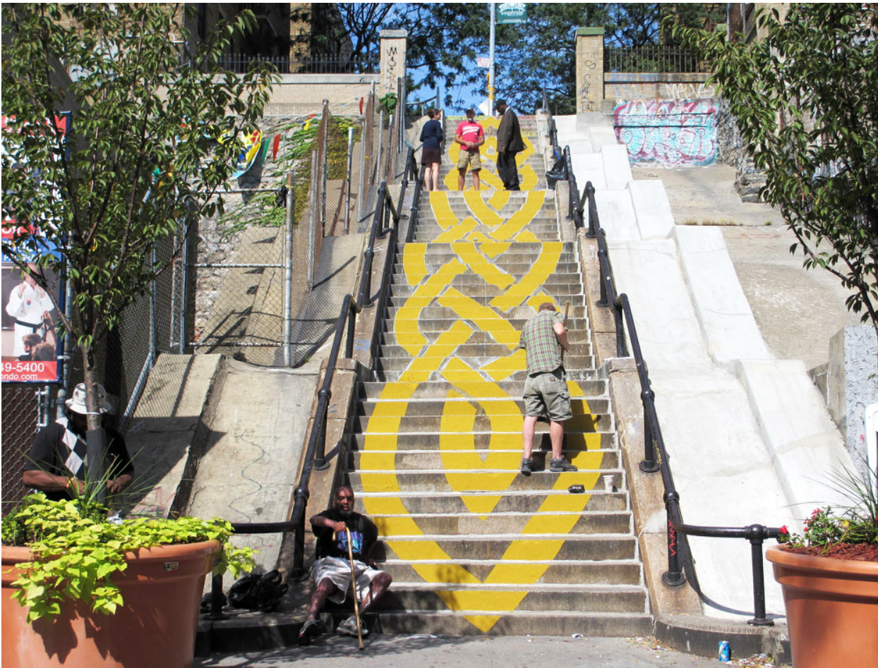
FIGURE 12 | Step Streets at 232nd Street and Broadway incorporate design and landscape to add to a unique pedestrian environment.

use cobra head lamps. These work well for vehicular environments but would seem cold and impersonal on quiet pedestrian streets. Many historic districts and BID's utilize unique lampposts that can be adorned with banners or planters to emphasize a common theme. Pedestrian scale lighting can be used to supplement street lighting along key pathways, bikeways, plazas and parks.