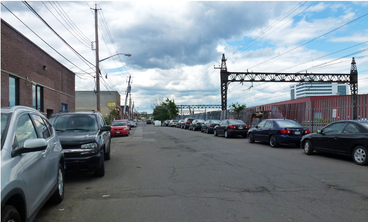
FIGURE 2 | Low-density manufacturing uses along Bassett Avenue in the Bronx are located adjacent to the Amtrak Hellgate line and the proposed Morris Park Metro-North station.

In some areas, there are existing industrial loft buildings. This built form is no longer the ideal of modern industrial uses, which need larger floor-plates all on