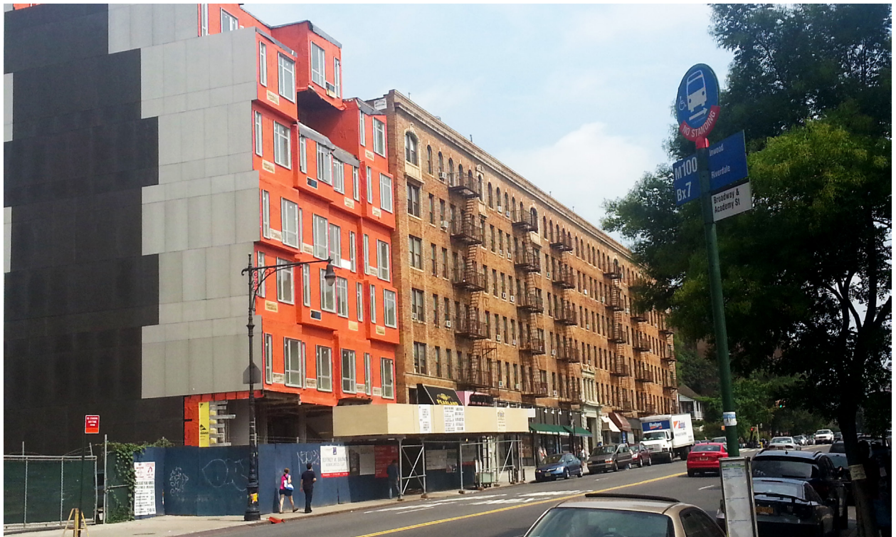
FIGURE 6 | Pre-fabricated apartment units in the Inwood neighborhood of Manhattan. Designs that integrate residential and commercial uses are key in developing vibrant high-density areas.

In order to thrive as transit-oriented developments, the areas surrounding rail stations in the Bronx require zoning that supports a variety of uses. Addressing areas with underutilized land and buildings, ensuring that local retail and residential densities support transit stations, and targeting regional centers with potential for growth will allow the Bronx to better capitalize on its Metro-North commuter rail stations, as well as provide additional housing opportunities to accommodate future growth.