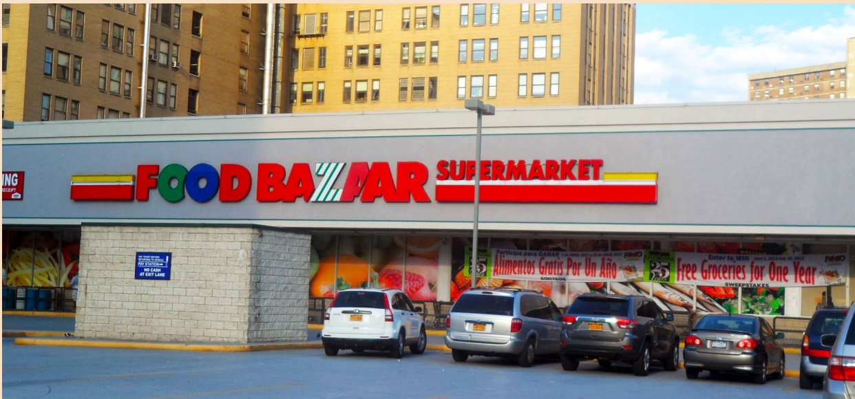
FIGURE 5 | Food Bazaar Supermarket, part of the FRESH zoning and tax incentive program, in the Melrose neighborhood's Concourse Plaza. To date, the Bronx has five approved FRESH projects, three of which have opened.

The Food Retail Expansion to Support Health Program (FRESH) provides development incentives for opening grocery stores in New York City communities with limited access to fresh food. The program offers zoning incentives that increase the allowable floor-area-ratio (FAR) in mixed use buildings, reduce the parking requirements, and permit larger grocery stores as-of-right in light manufacturing districts, provided that a grocery store allocates at least 6,000 square feet towards grocery products, and, of which, at least 500 square feet is dedicated to fresh produce. The program also includes significant tax incentives to FRESH stores. Much of the South Bronx is in a FRESH designated area and the Borough has seen a number of new and expanded stores because of the program.