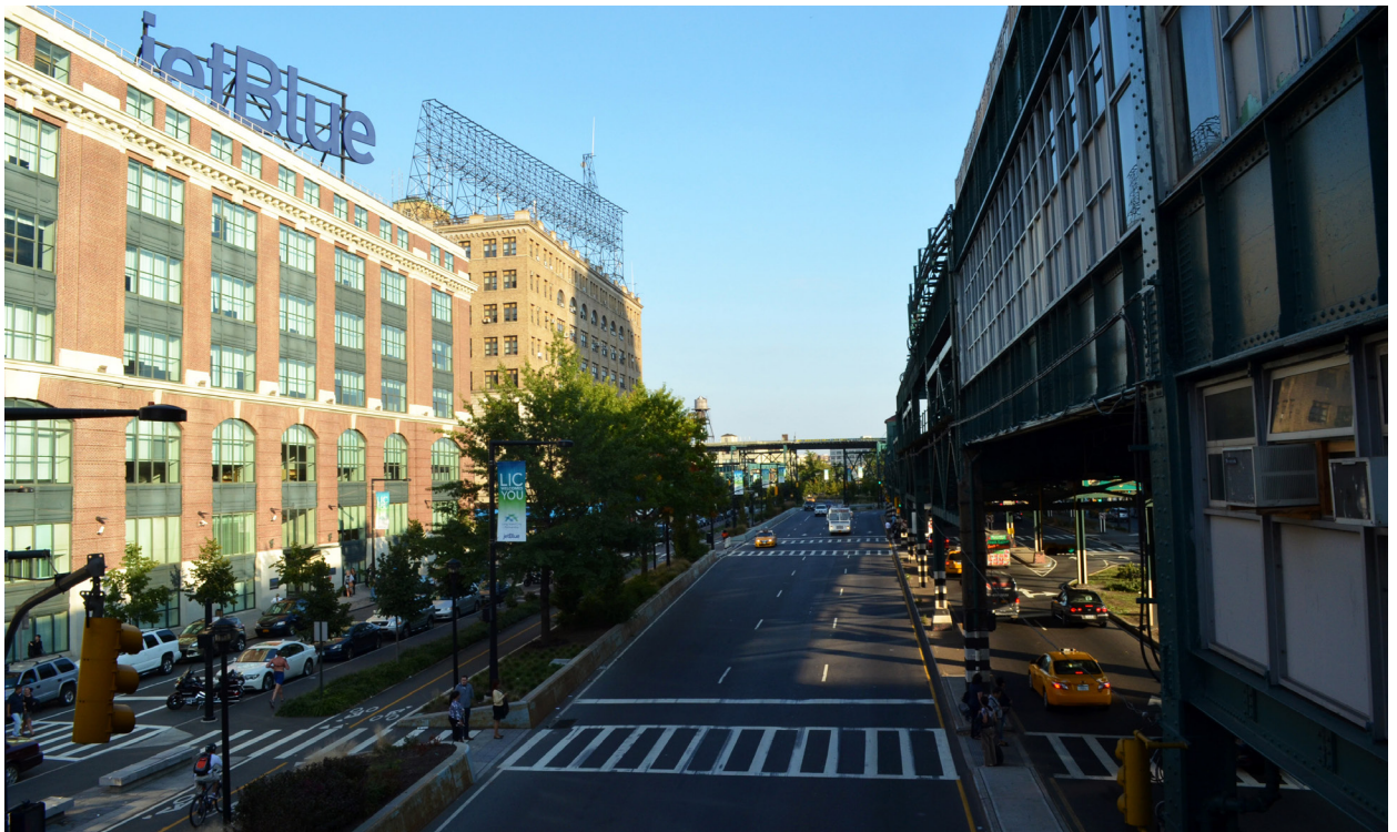
FIGURE 3 | Long Island City, Queens. This area has been widely redeveloped, emerging from its industrial past to attract large national employees and new residential developments. Jet Blue Airlines opened its new offices in April of 2012 off the Queensborough Bridge.

The strategy of applying medium density residential zoning districts near transit is simply extending the