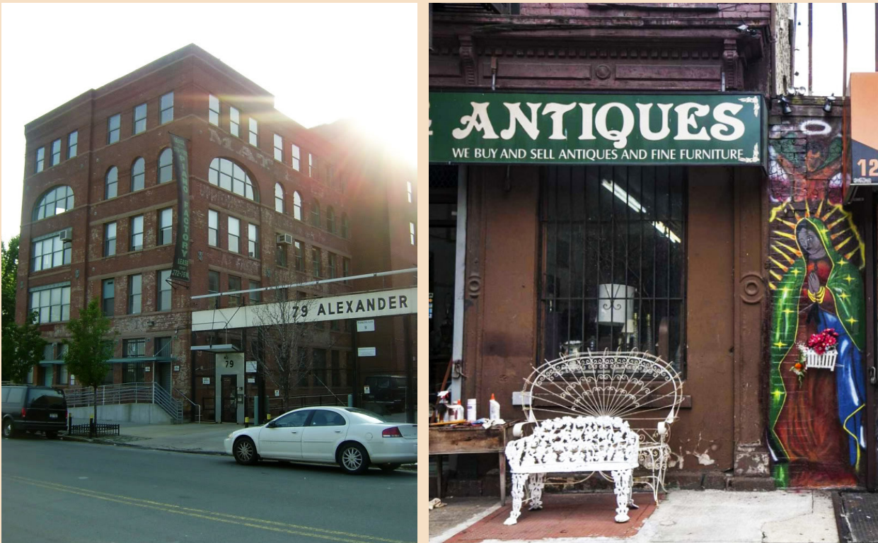
FIGURE 4 | Port Morris, an area in the South Bronx, has recently begun to experience renewed investment and growth. (Left) New residential development. (Right) “Antique Row.”

MX districts can help manufacturing and residential uses coexist. Like Port Morris, many of the station study areas zoned for manufacturing have become inactive overtime. Establishing an MX district can promote a transition to a mix of uses, helping to foster residential growth and revitalization.