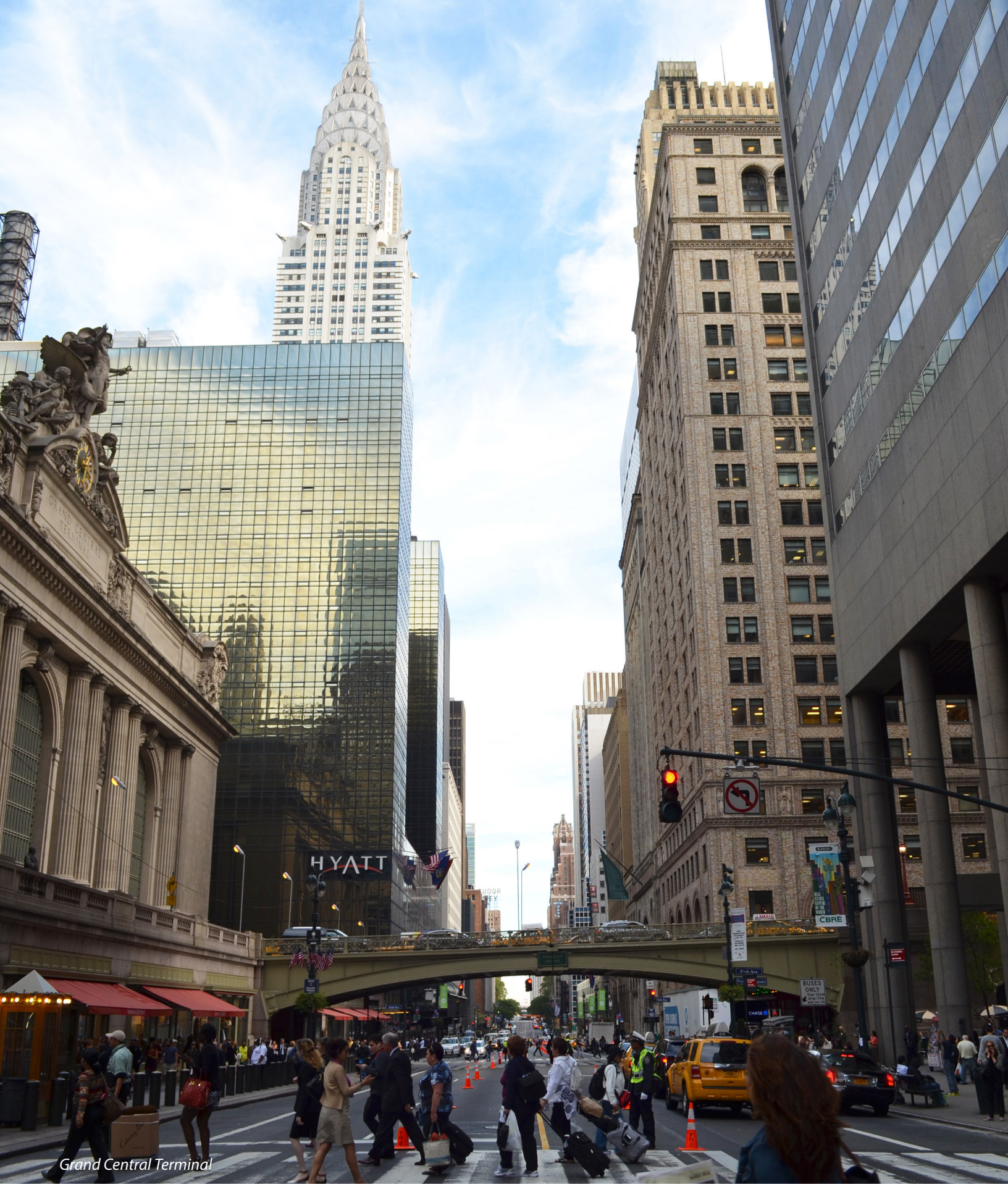
Grand Central Terminal