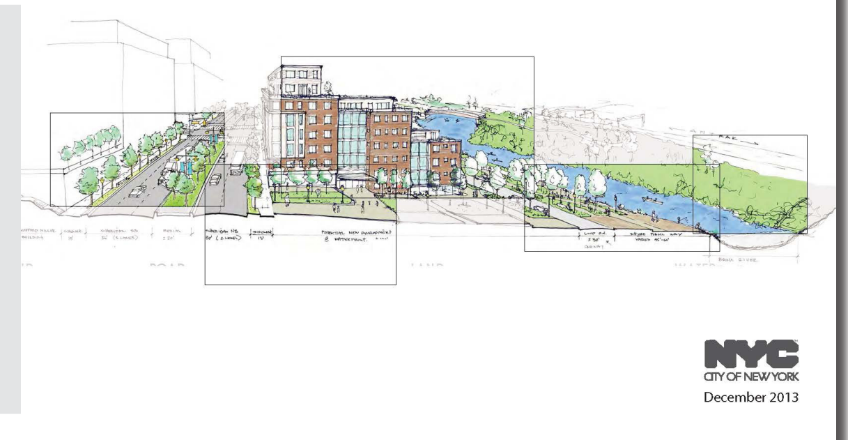
THE SHERIDAN EXPRESSWAY STUDY Reconnecting the Neighborhoods Around the Sheridan Expressway and Improving Access to Hunts Point

After the study is complete, it serves as a guiding document for decisions affecting the area in question. Some of the strategies outlined will be enacted over the short term, while others will take more work and time to be fully realized.