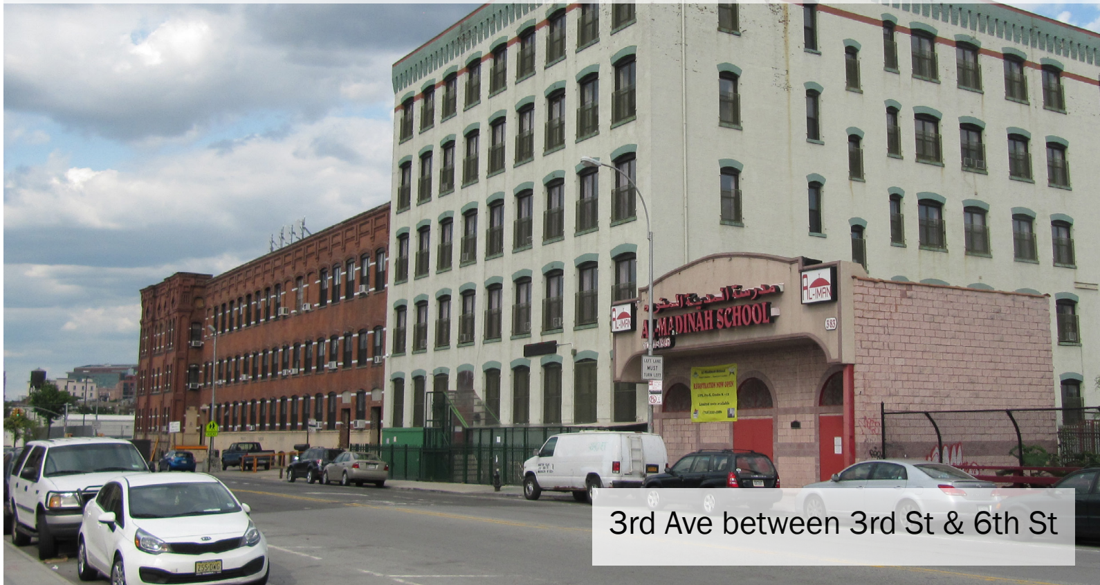
3rd Ave between 3rd St & 6th St