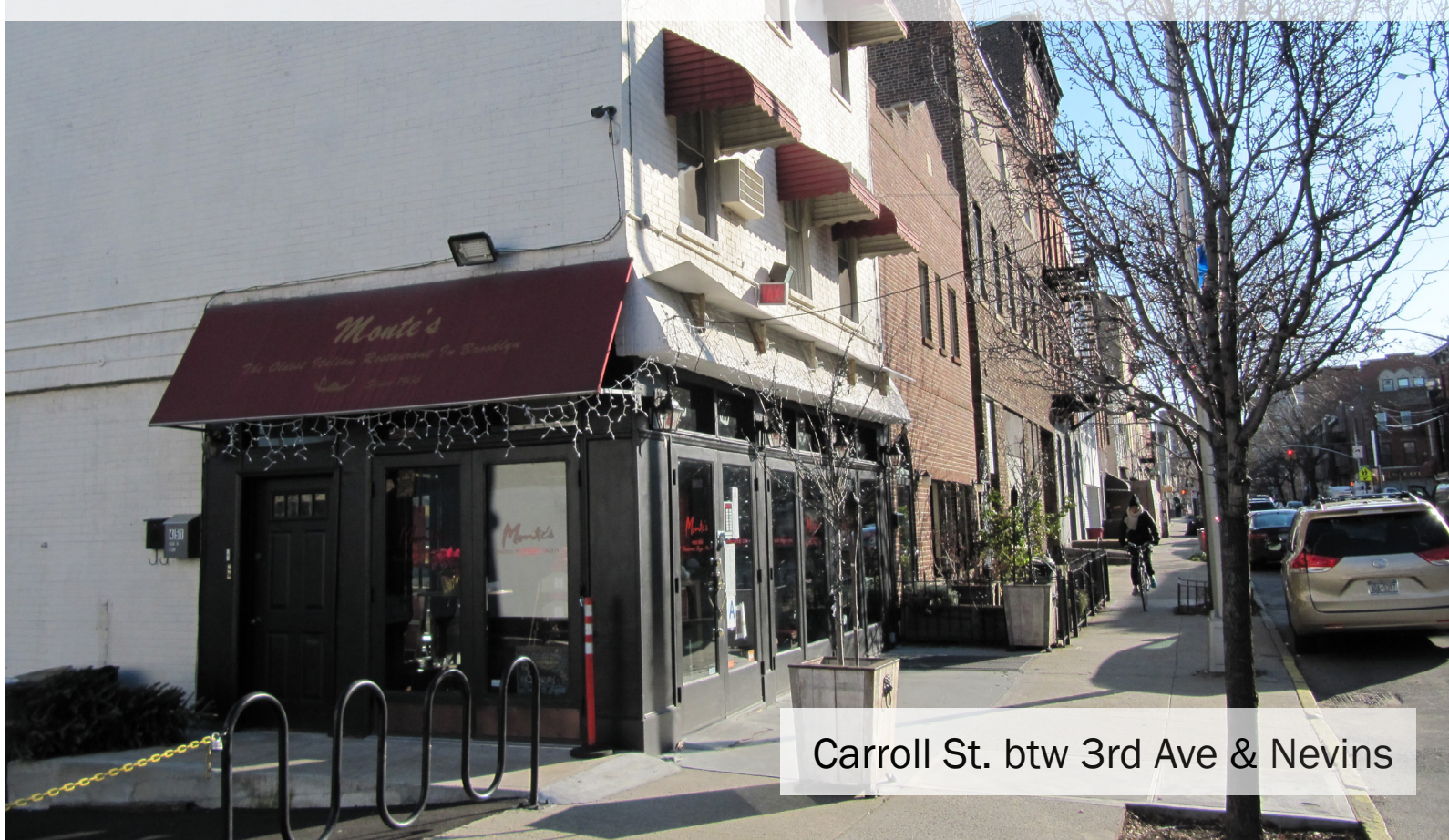
Carroll St. btw 3rd Ave & Nevins