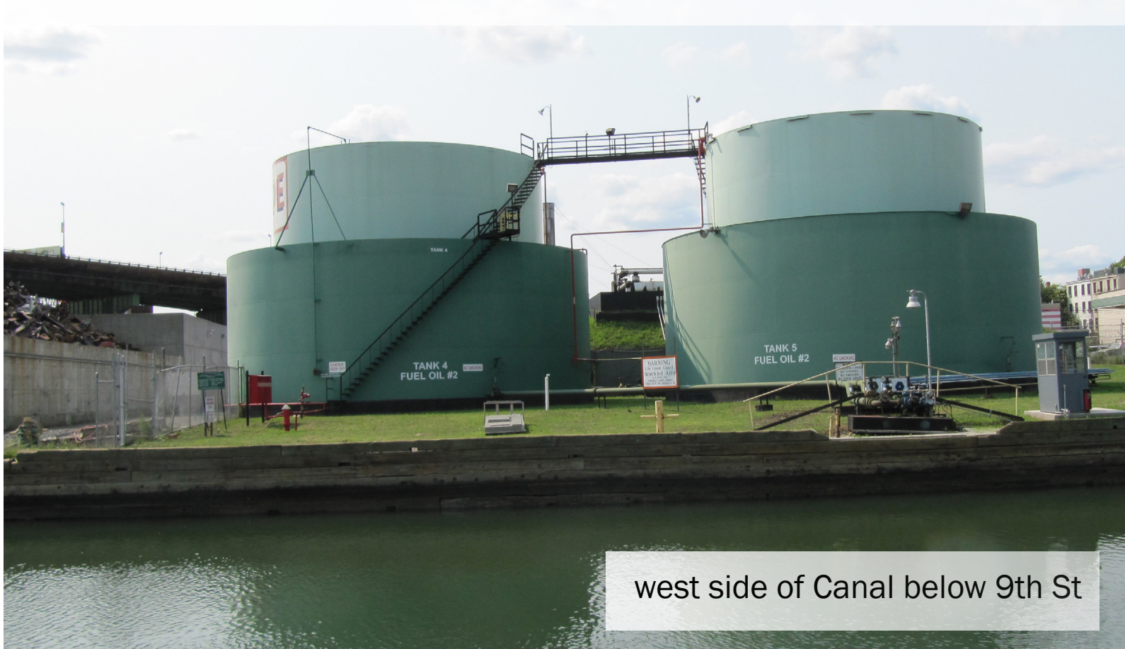
west side of Canal below 9th St