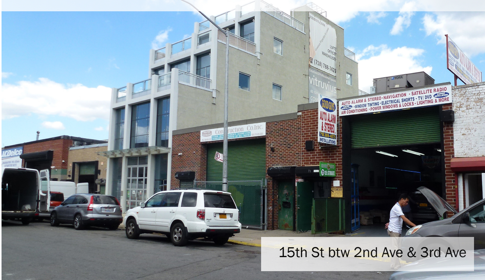
15th St btw 2nd Ave & 3rd Ave