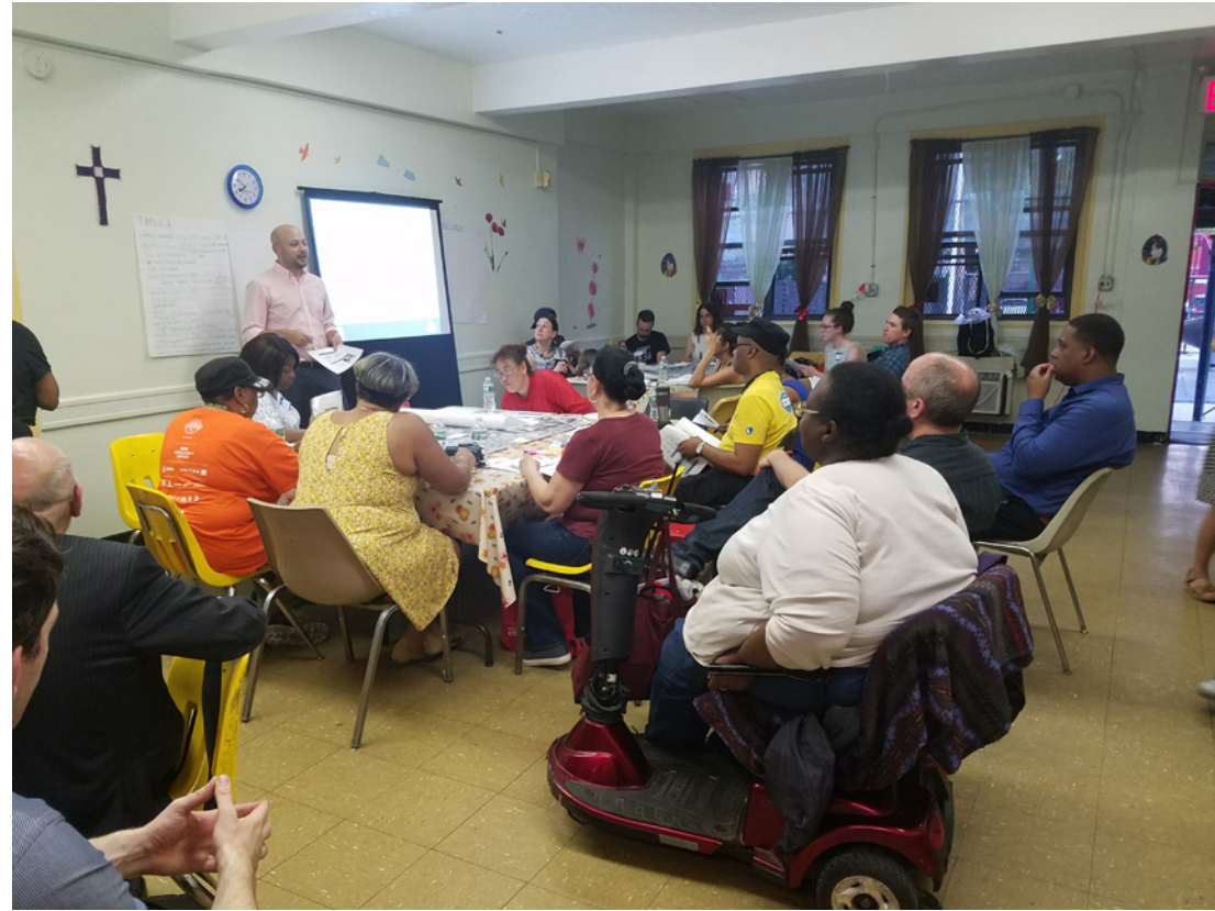
Housing Working Group Meeting 4 Gowanus Houses Senior Center May 2017