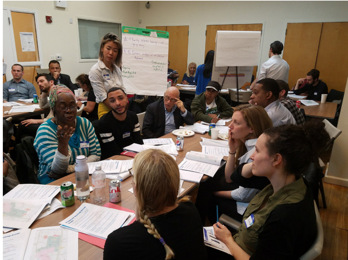
First Housing Working Group Meeting at Fifth Avenue Committee, March 2017

Together, the approach outlined in the Framework sets a vision for how to ensure that our investments today help individuals and families achieve economic stability, live in safe and healthy homes, and enjoy a sense of community that allows people of all different backgrounds to call Gowanus home.