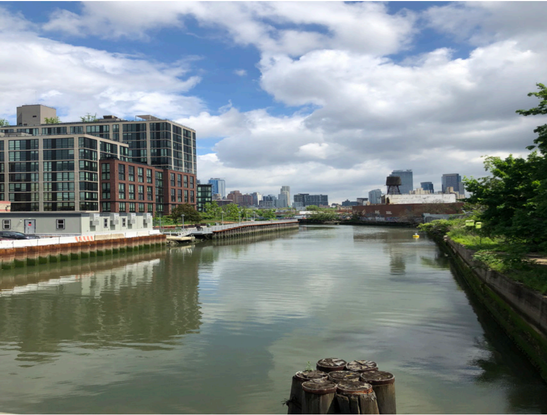
363-365 Bond Street