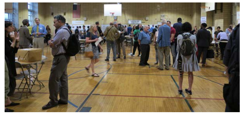
Open house and attendees