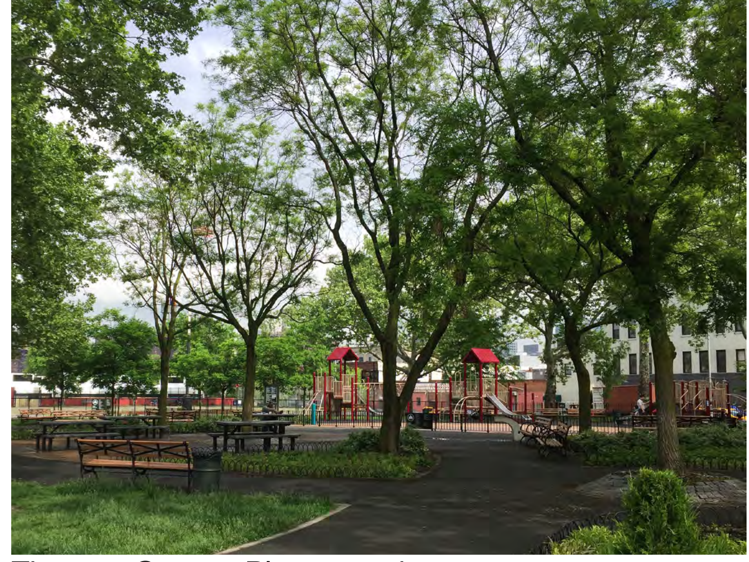
Thomas Greene Playground