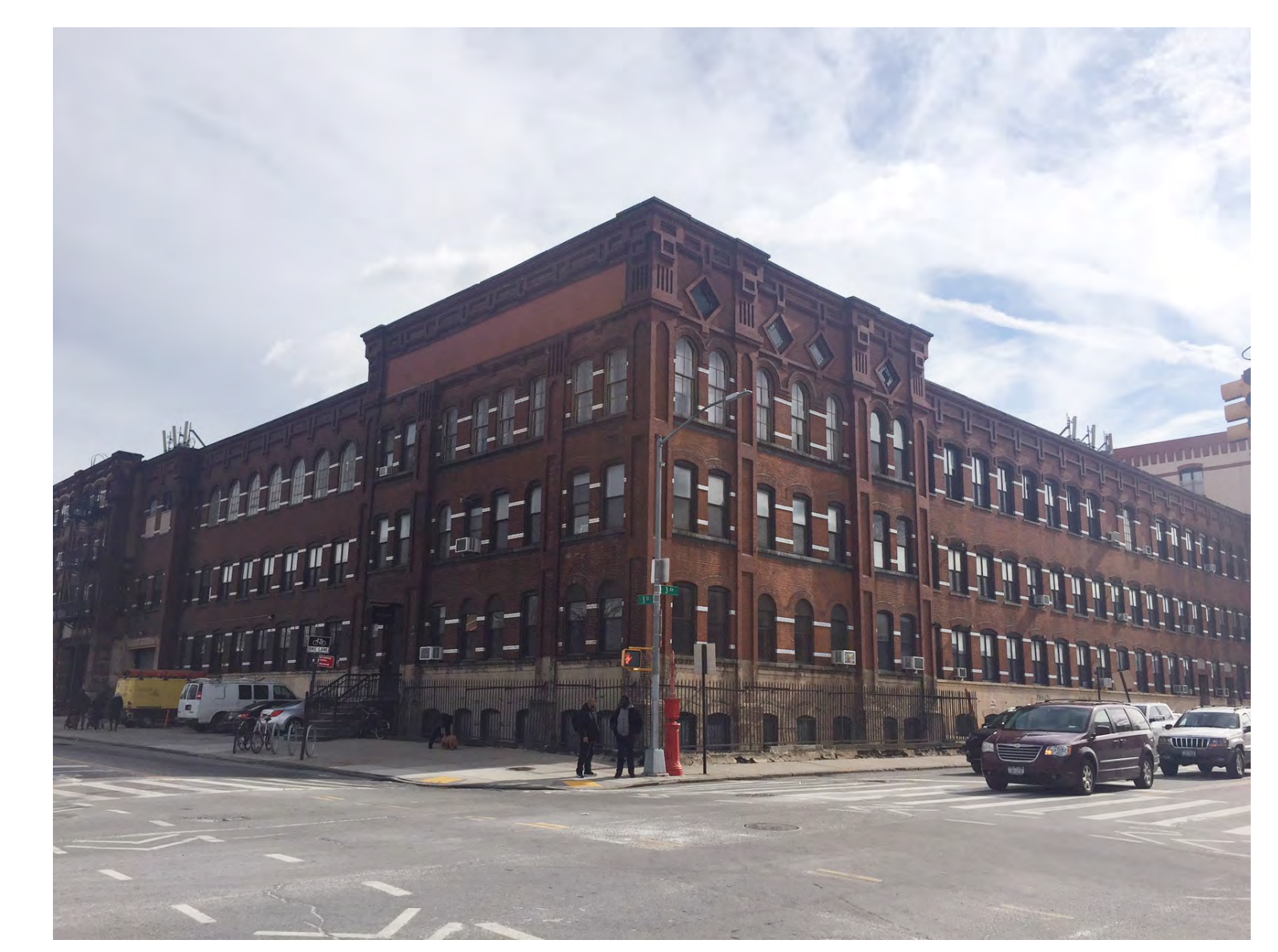
The Old American Can Factory, 3rd Street and 3rd Avenue