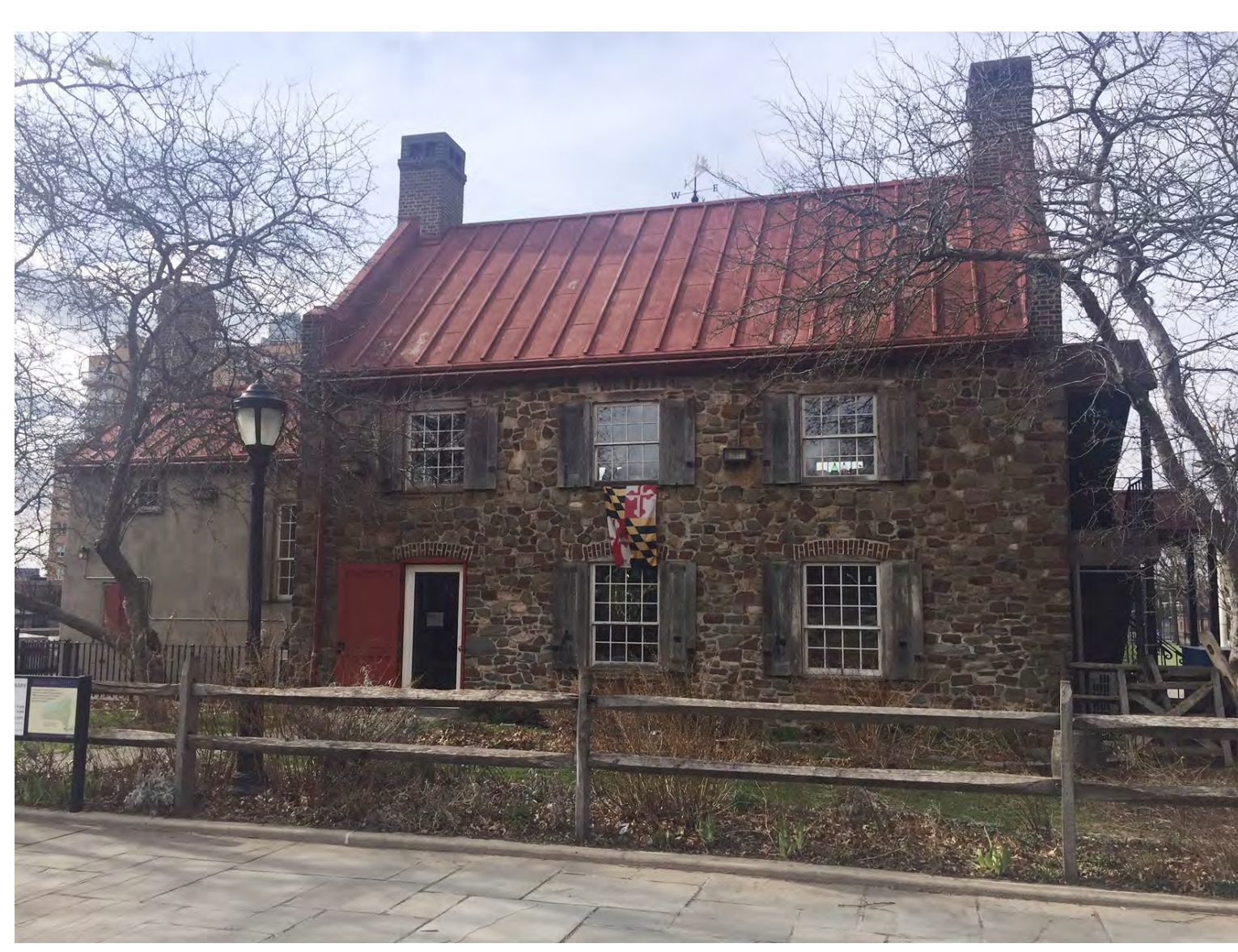
The Old Stone House in J.J. Byrne Playground