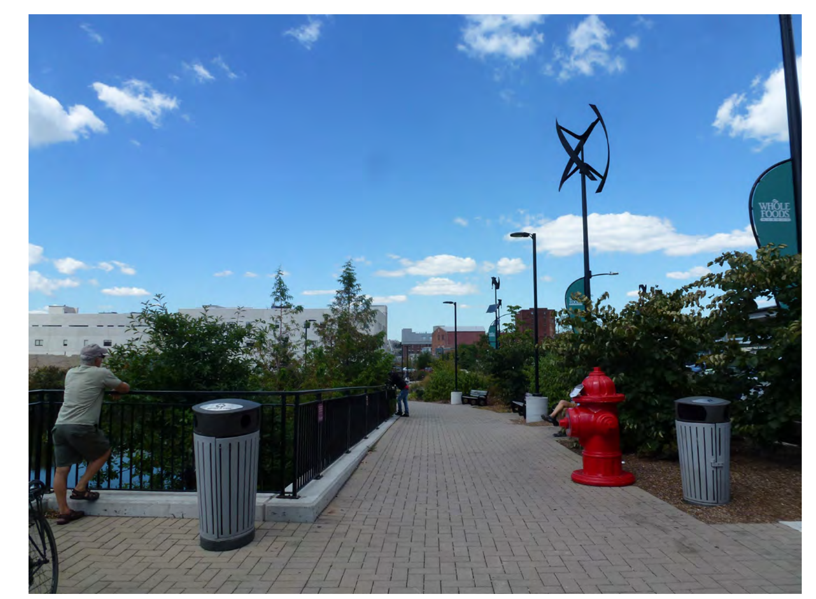
Whole Foods Waterfront Public Access Area

Gowanus's history and ecology, from a natural estuary and battleground of the Revolutionary War to its rich industrial past and current diverse mixed-use nature, are reflected in its built fabric, uses and stakeholders. As Gowanus evolves into its future, the framework and subsequently the Neighborhood Plan will identify strategies to remember and honor this rich history through various approaches to preservation and historic interpretation.