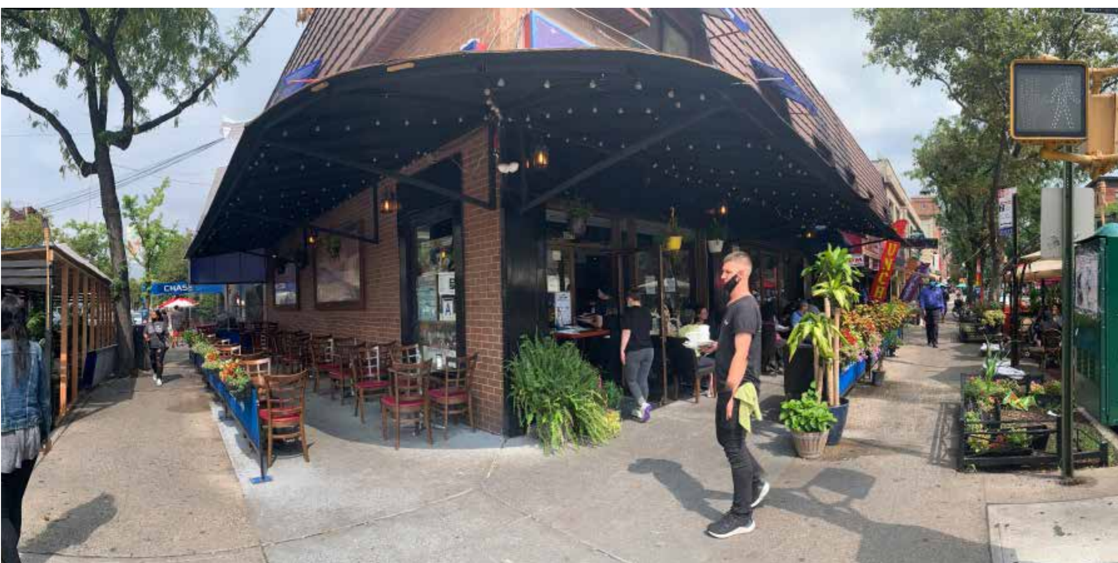
Photo: Restaurant outdoor dining, Bronx

After you have viewed the recommendations, we encourage you to join the conversation, share your priorities, and provide your own guidance as a member of the community.