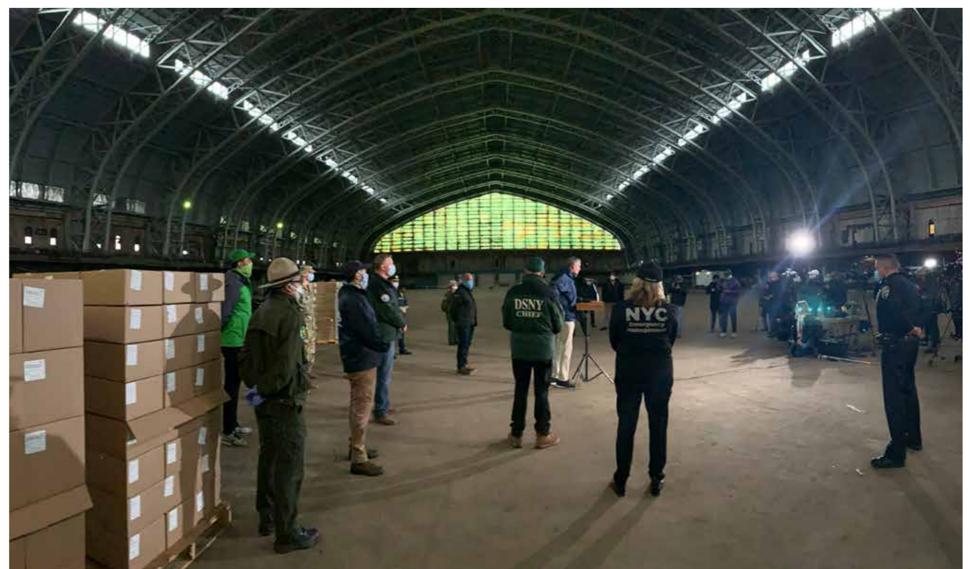
Photo: Food distribution center, Bronx