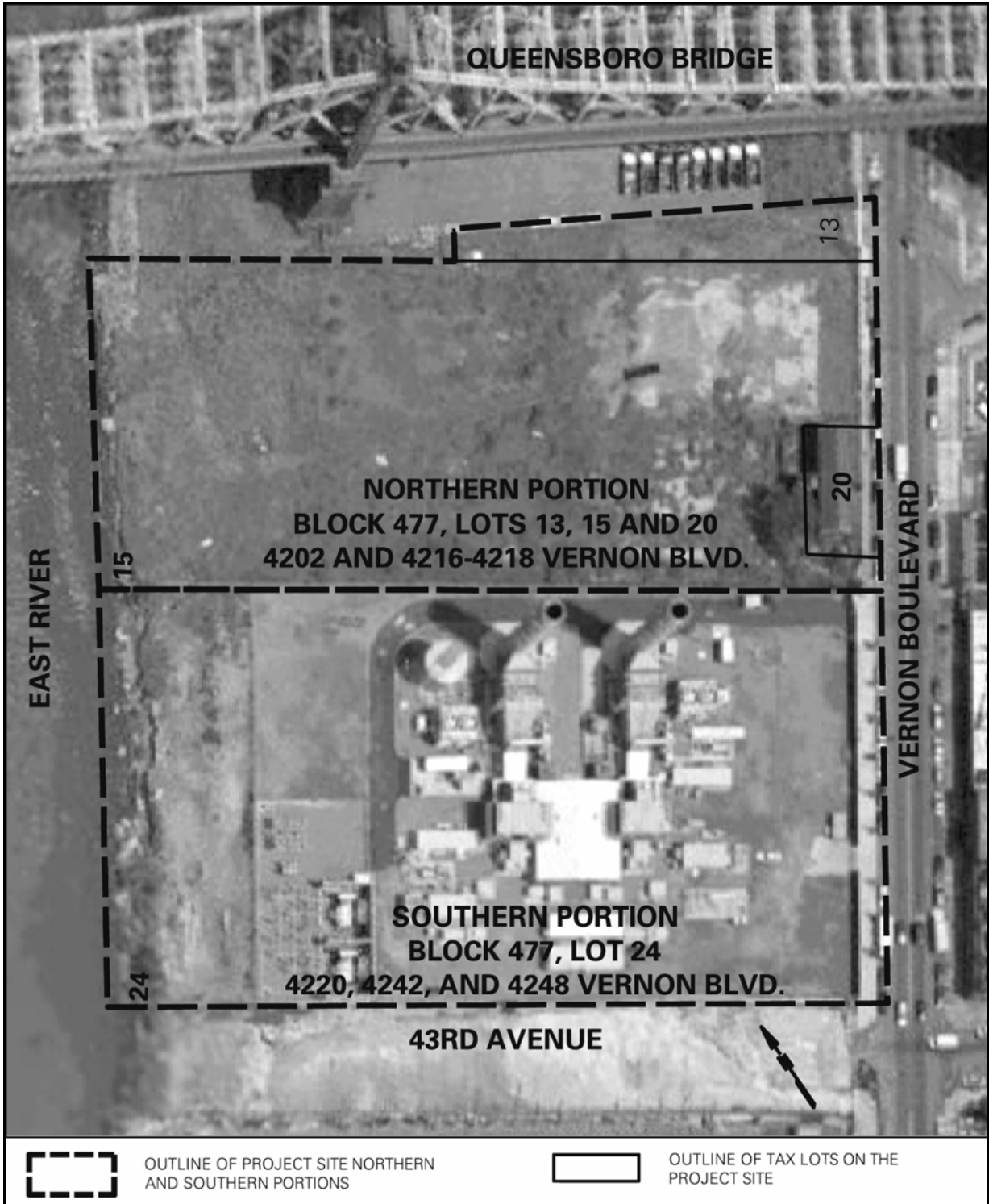
Figure 17-1: Aerial View of Project Site