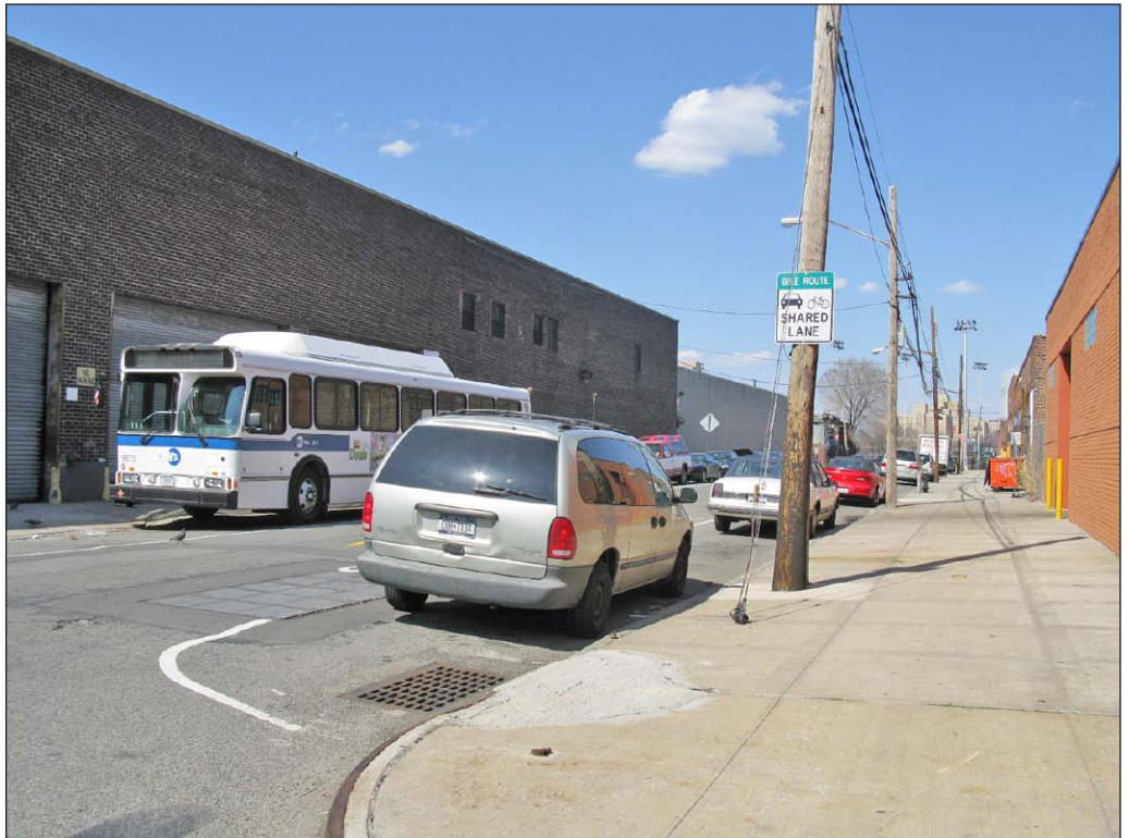
View northwest at 27th Avenue and 1st Street 2