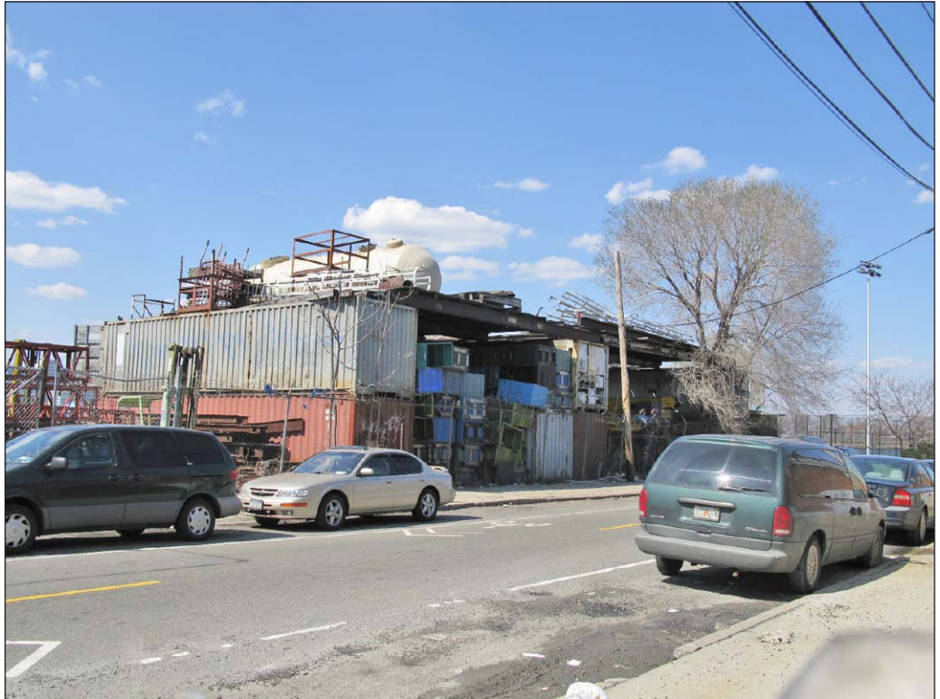
View northwest on 1st Street near 26th Avenue 3