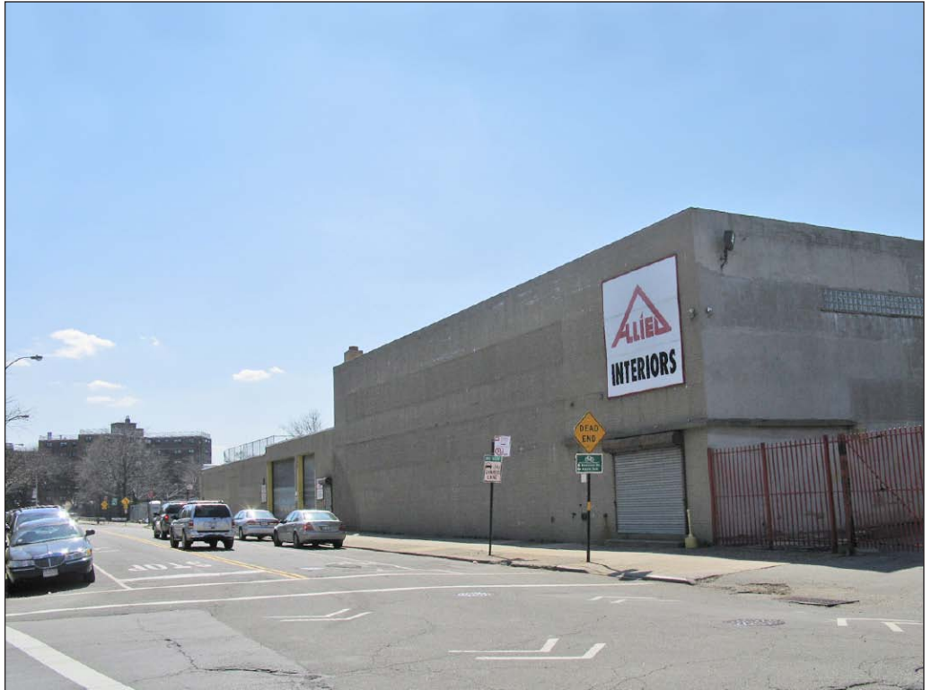
View southwest at 27th Avenue and 1st Street 1