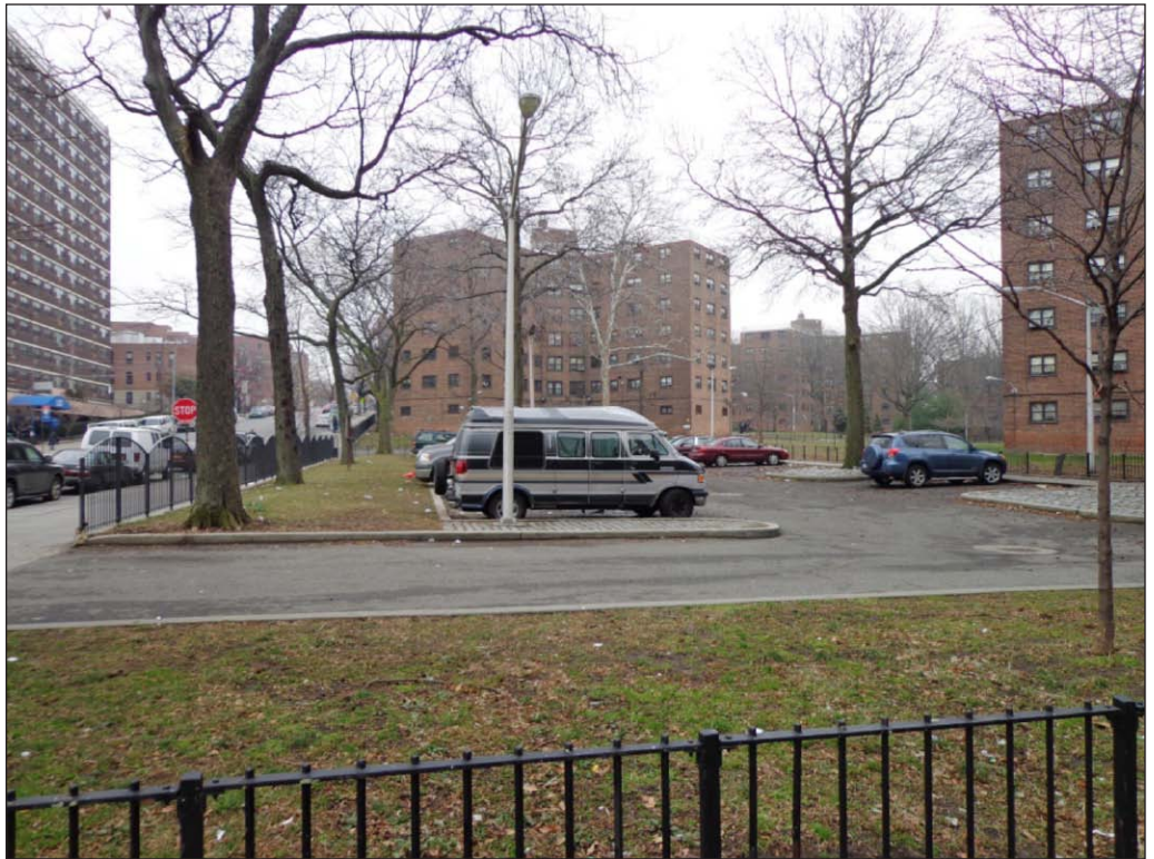
View east of parking lot and NYCHA buildings on the Astoria Houses campus 6