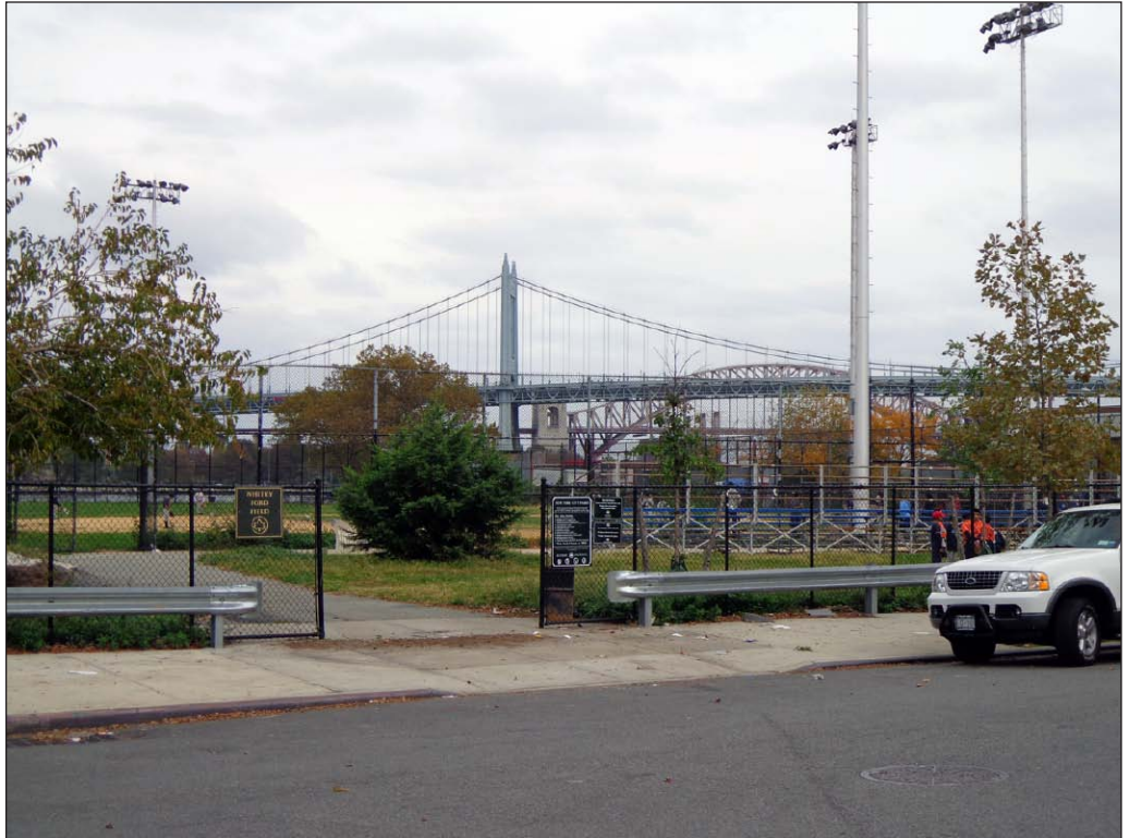
View of Whitey Ford Field from 26th Avenue 5