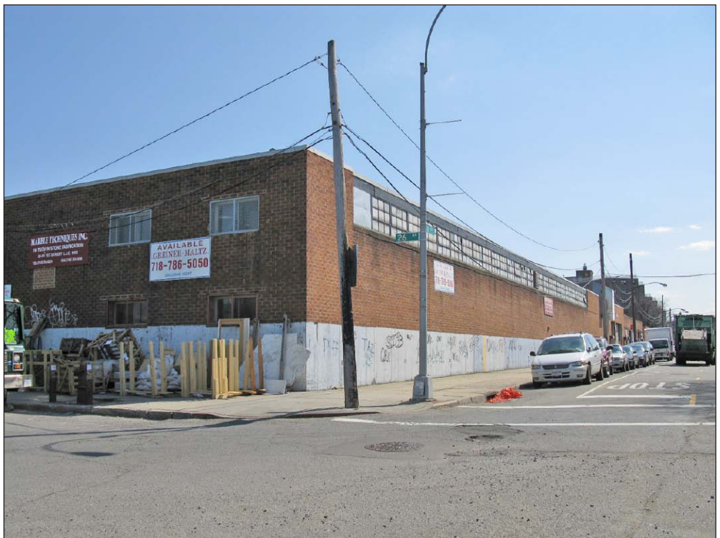
View southeast at 26th Avenue and 1st Street 4