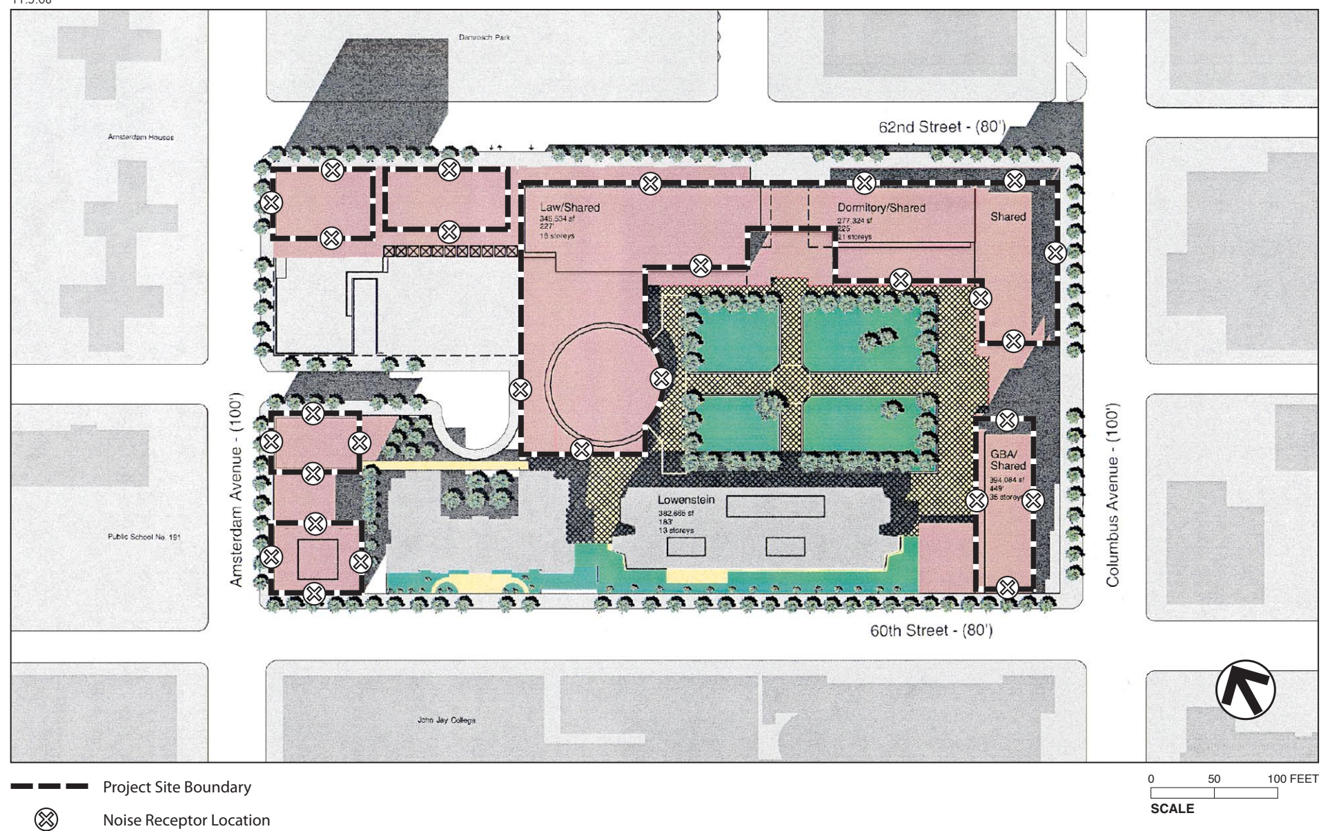
Figure 18-2 Noise Receptor Locations