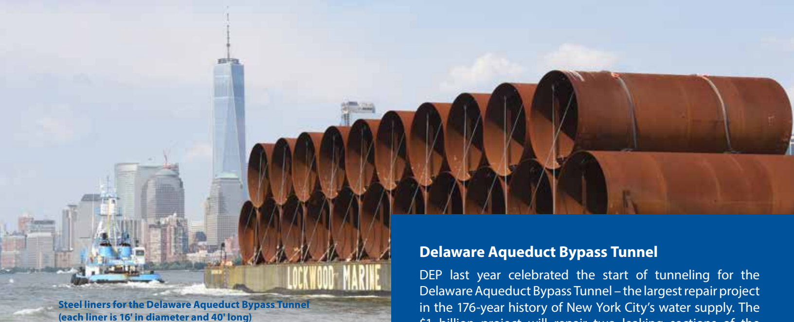
Steel liners for the Delaware Aqueduct Bypass Tunnel (each liner is 16' in diameter and 40' long)