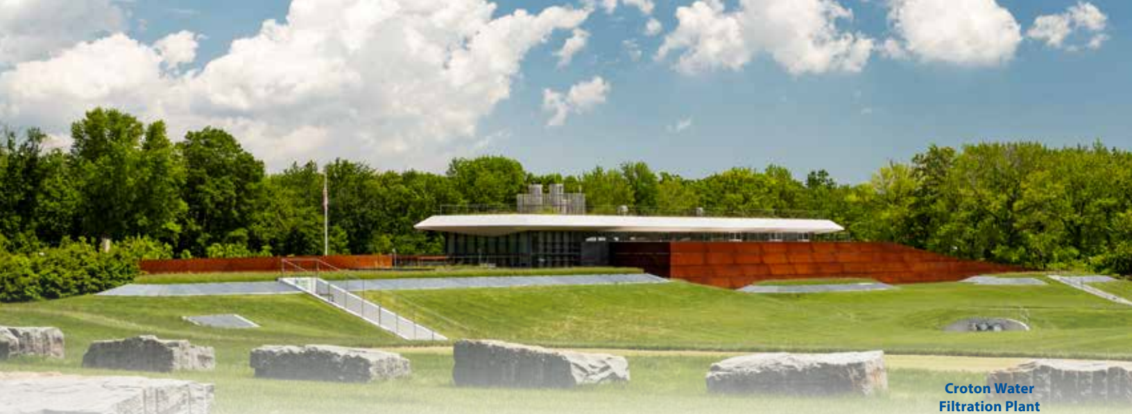
Croton Water Filtration Plant