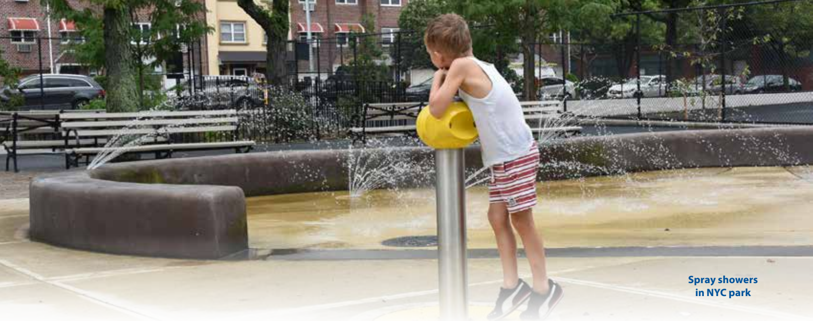
Spray showers in NYC park