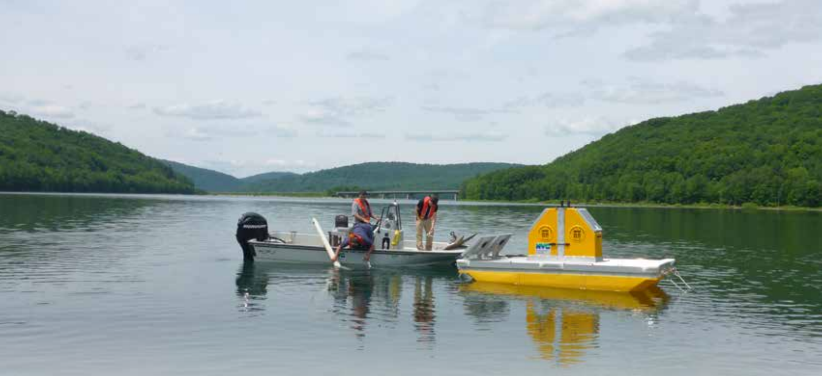
Robotic water quality monitoring in the watershed