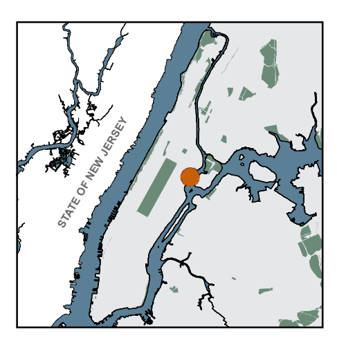
Prepared by: NYCHA Performance Tracking & Analytics Department