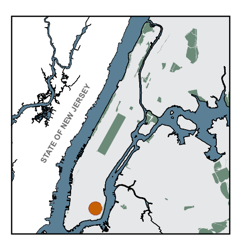
Prepared by: NYCHA Performance Tracking & Analytics Department