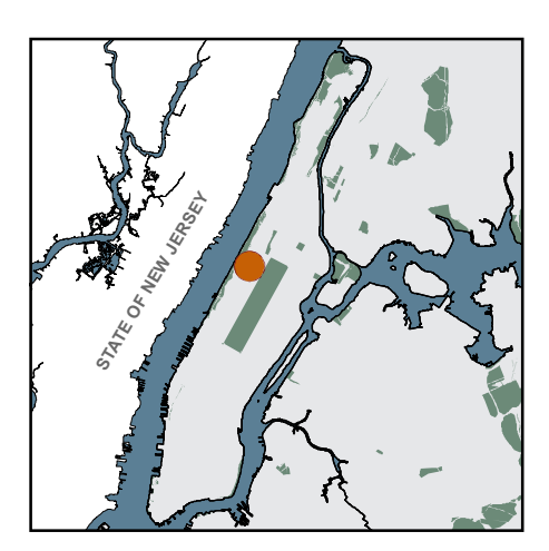
Prepared by: NYCHA Performance Tracking & Analytics Department