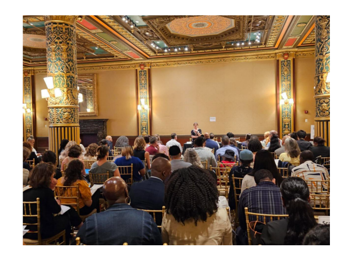
March Public Meeting

<u>Click here to see more events happening at</u> <u>the NY Public Library!</u>