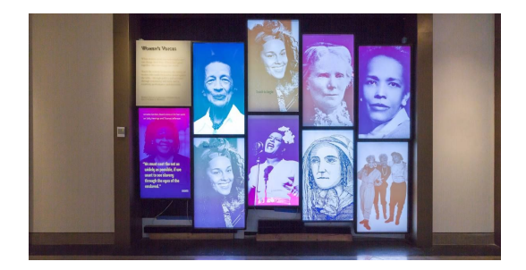
The Center for Women's History

March marks Women's History Month, a month that highlights the contributions of women from the past and present who have helped build and continue to mold society. Below you can find some ways to honor the women who have fought for change and continue to fight.