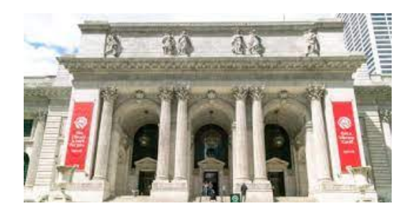
Women's History Events at The New York Public Library

a plea to a founding father, to the suffragists to Title IX, to the first female political figures, women have blazed a steady trail towards equality in the United States. <u>Click here to check out the</u> <u>timeline!</u>