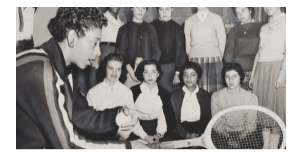
Women's History Milestones Timeline

The Center for Women's History is showcasing the lives and legacies of women