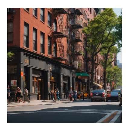
Provider Spotlight: Special NOFO Series

In the fifth installment of our ongoing Provider Spotlight: Special NOFO Series, this month the CoC would like to spotlight Jericho Project who was recently awarded funding from HUD's <u>Special NOFO</u> for their project Jericho Unsheltered Rapid Rehousing Program .