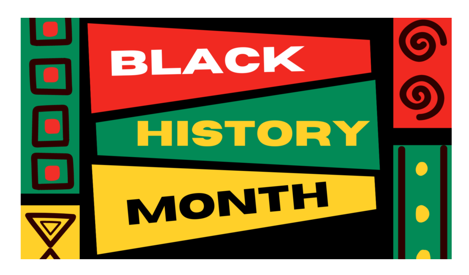
Black History Month Celebrations & Events

In Honor of Black History Month, below you can find some events that are celebrating, amplifying, and exploring powerful stories, unsung histories, and radical imagination.