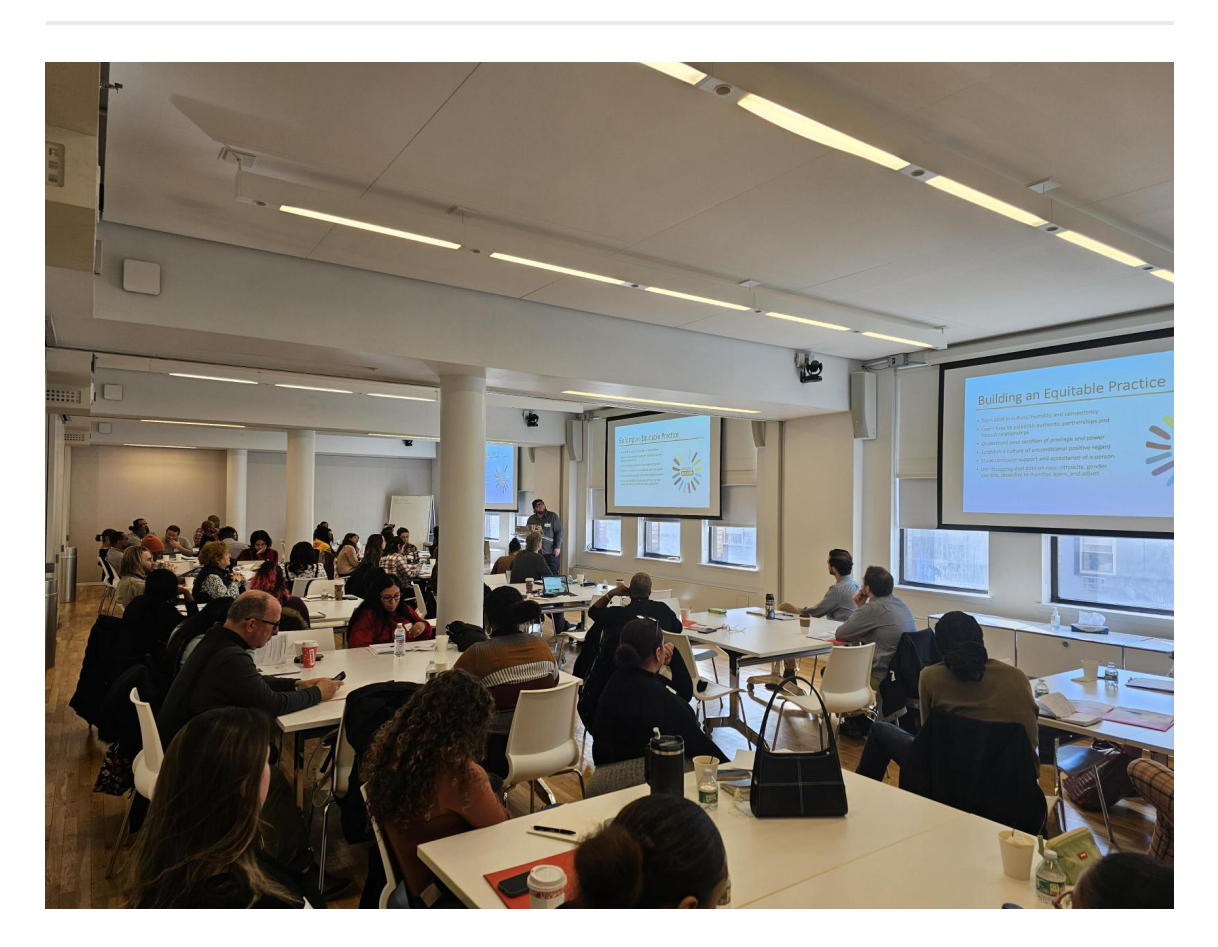
NYC CoC Rapid Rehousing Training Event ReCap

<u>Click here for more information and for tickets!</u>