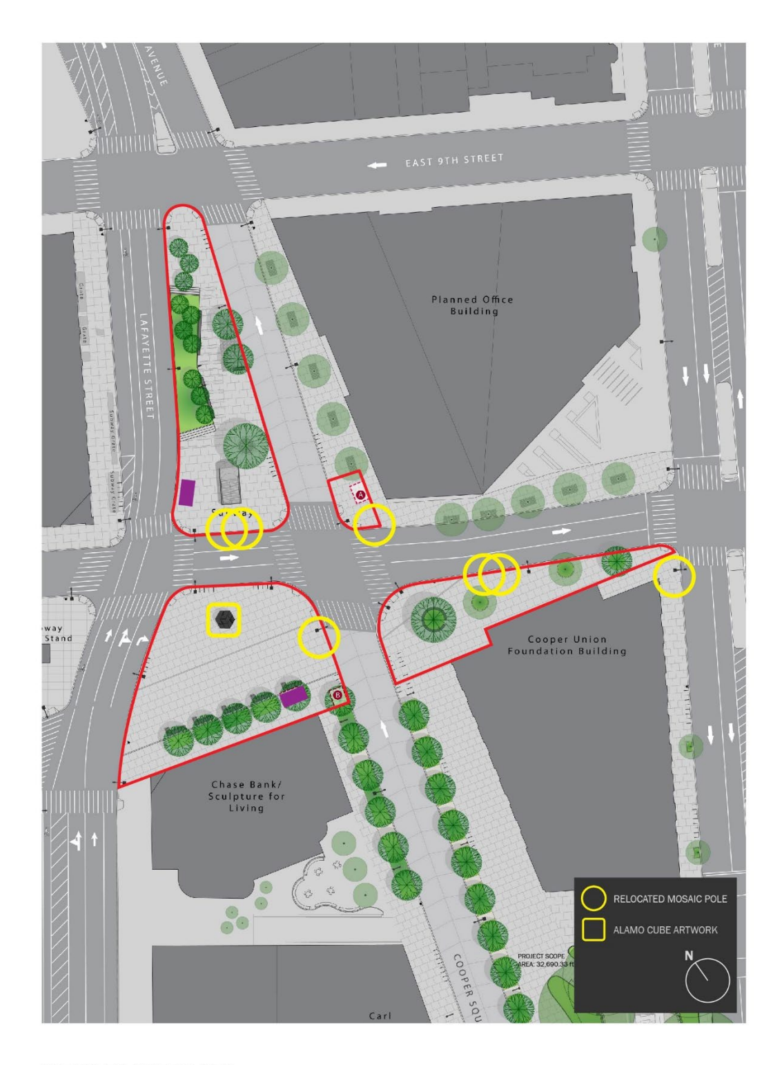
Exhibit A [Map of Licensed Plaza, which includes total square footage]