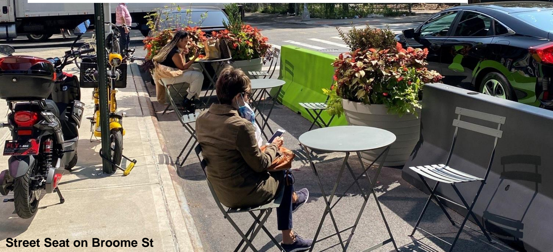
Street Seat on Broome St

DOT will continue to work with the LES BID and community stakeholders on public realm improvements along Broome Street and Orchard Street to prioritize pedestrians and cyclists