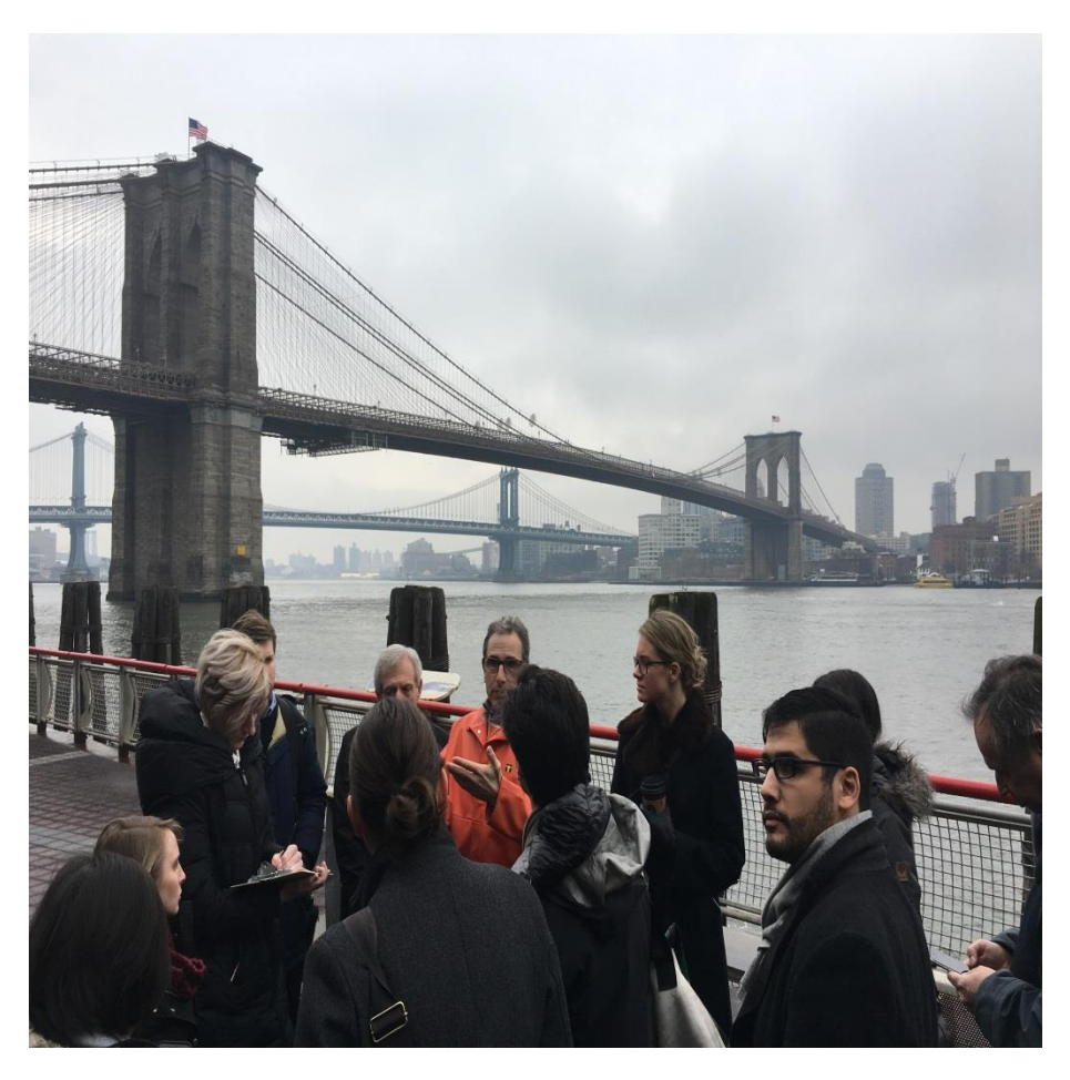
Seaport Tour with Lima Group 2/7/2017