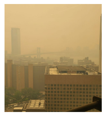
What a difference a day makes.... grab a mask and stay healthy