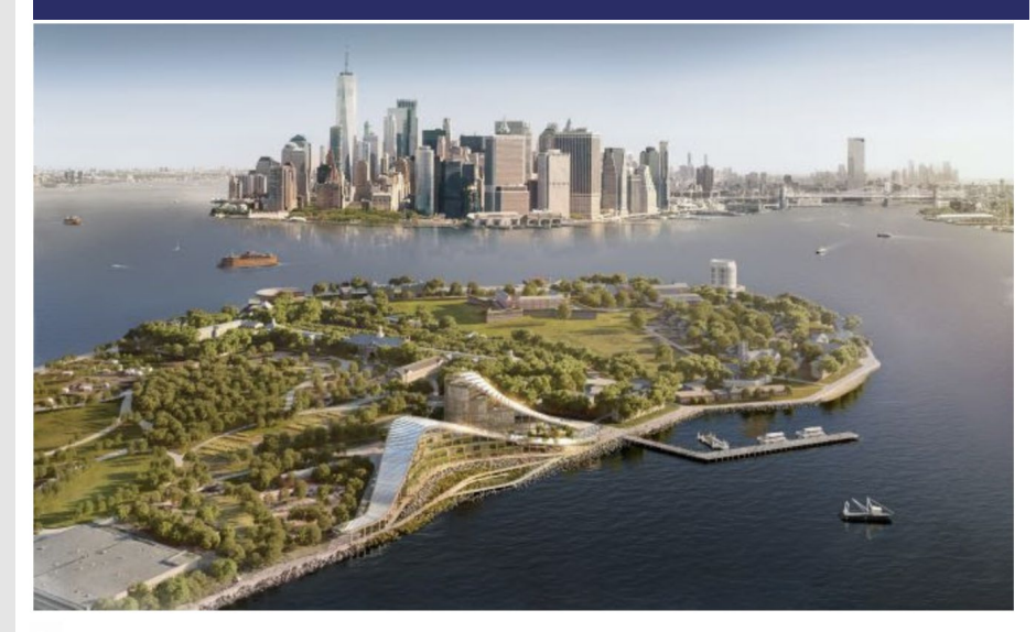
erial view of the Exchange, showing the iconic forms designed to evoke the dramatic landscapes and hills of Governors Island. Credit: Skidmore, Owings & Merrill