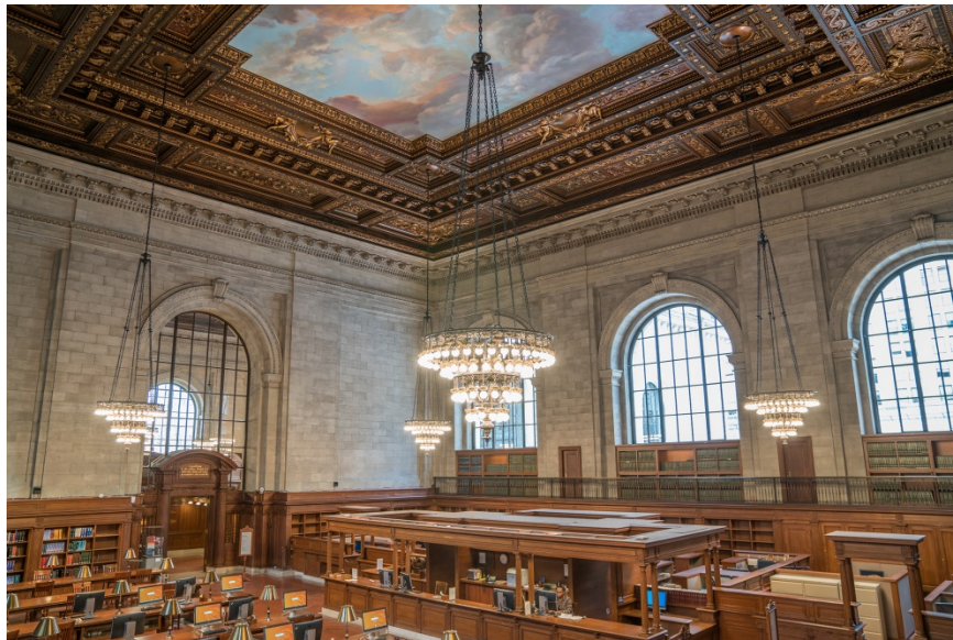
Bill Blass Public Catalog Room

Closed for repairs and restoration in 2014, these Beaux Arts masterpieces were reopened to the public with great fanfare in 2016, which presents a wonderful opportunity to celebrate their architectural, civic, and cultural significance, and to complete the ceremonial route to the Library's primary public reading room.