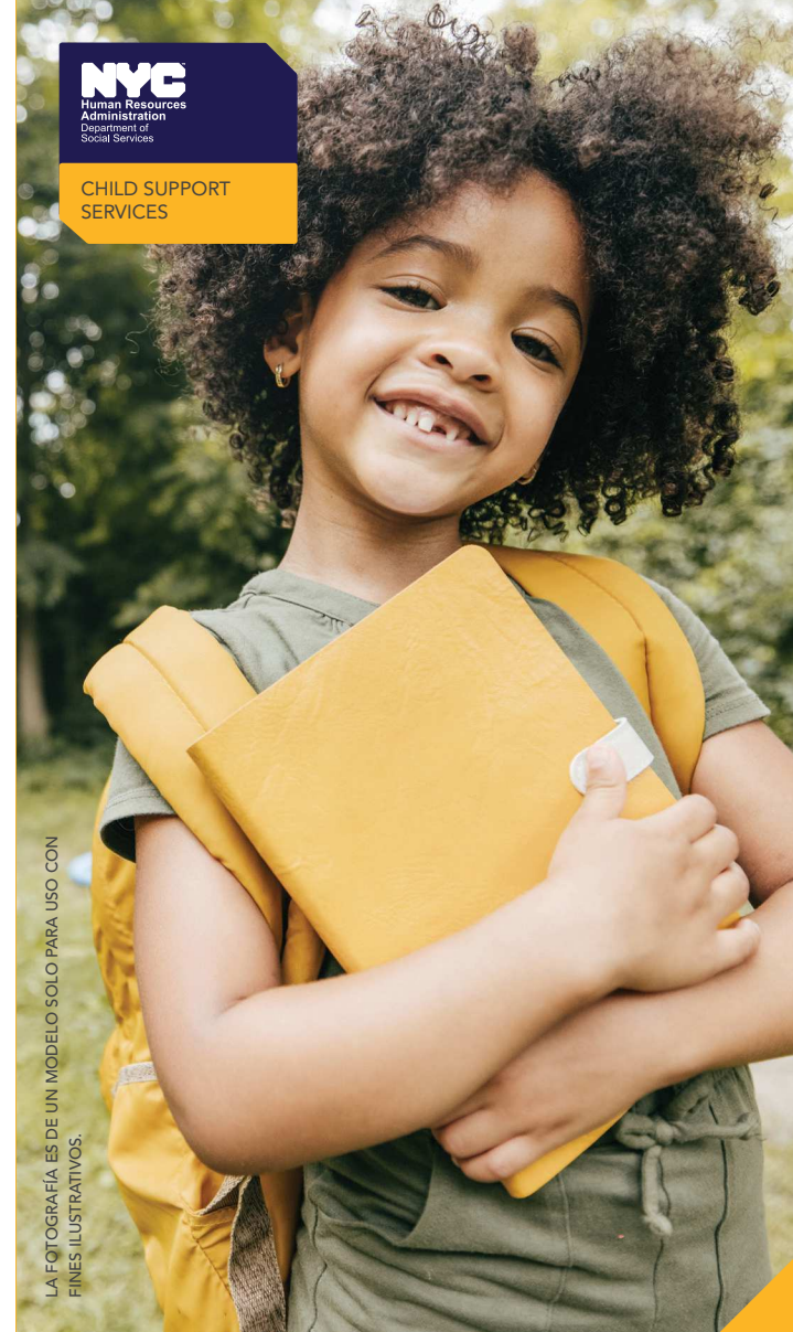
LA FOTOGRAFÍA ES DE UN MODELO SOLO PARA USO CON FINES ILUSTRATIVOS.

© Copyright 2022, The City of New York. Department of Social Services/ Human Resources Administration. For permission to reproduce all or part of this material contact the New York City Human Resources Administration.