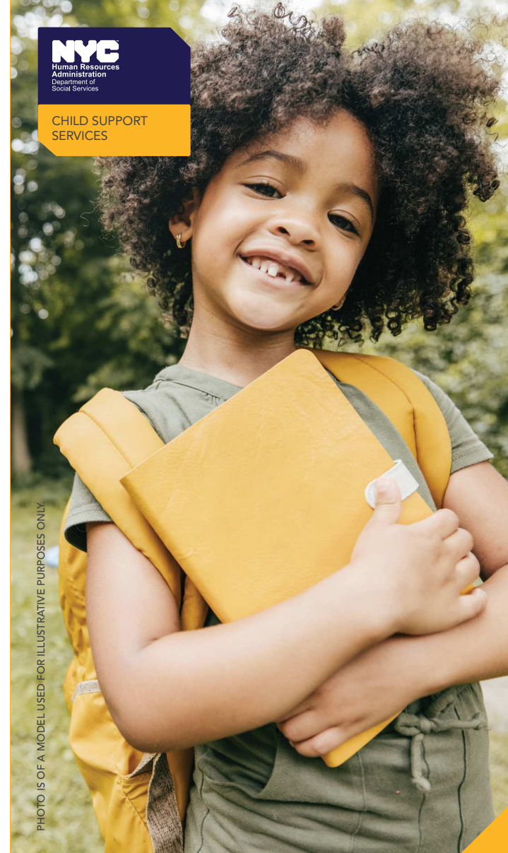
PHOTO IS OF A MODEL USED FOR ILLUSTRATIVE PURPOSES ONLY

Hard Conversations Are Part of Parenting