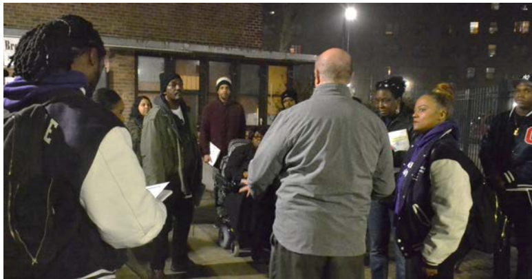
Safety Audits - MOCJ