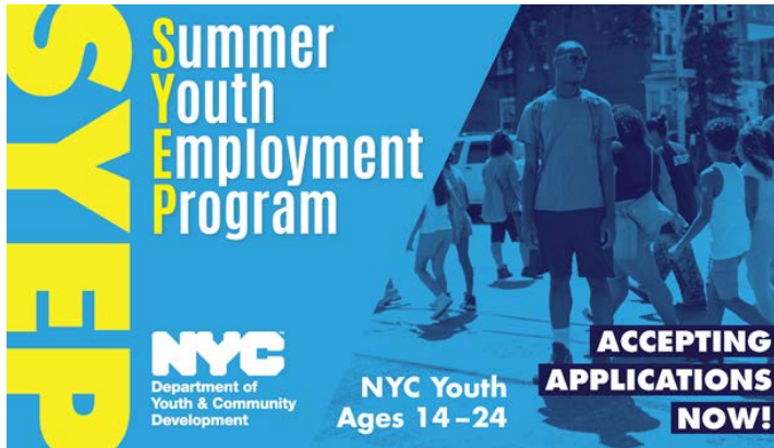
SYEP flyer - DYCD