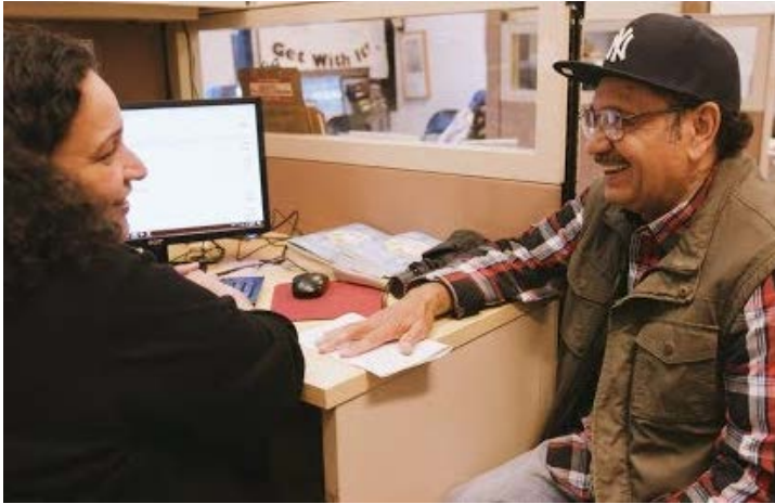
Housing Ambassador helps resident apply for affordable housing.