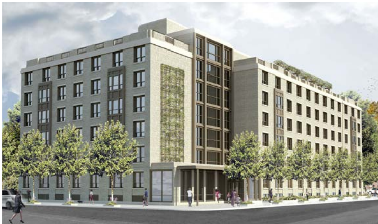
Rendering of Edwin's Place, 125 affordable homes for formerly homeless and low-income households