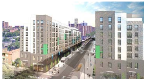
MARCUS GARVEY EXTENSION