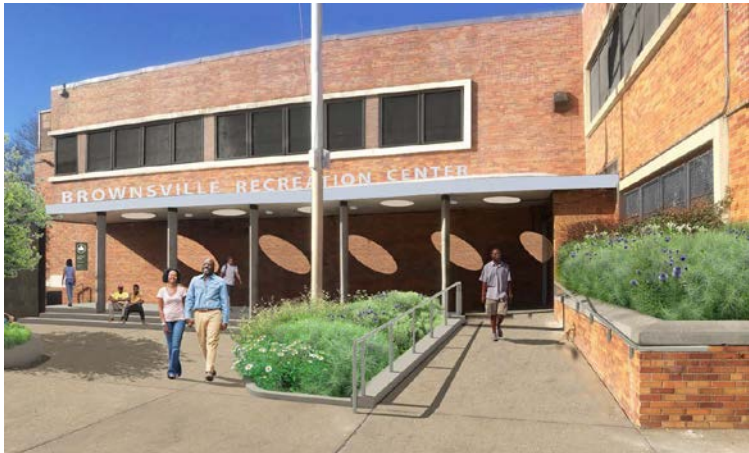
Brownsville Recreation Center (BRC) new entrance design