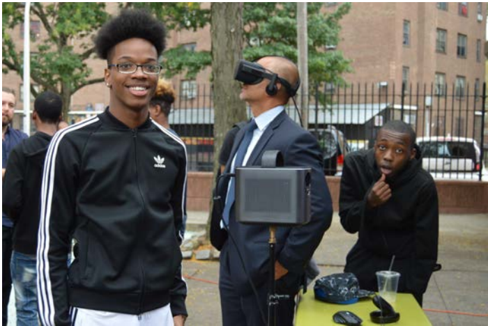
Young Innovator sharing VR technologies - MOCTO