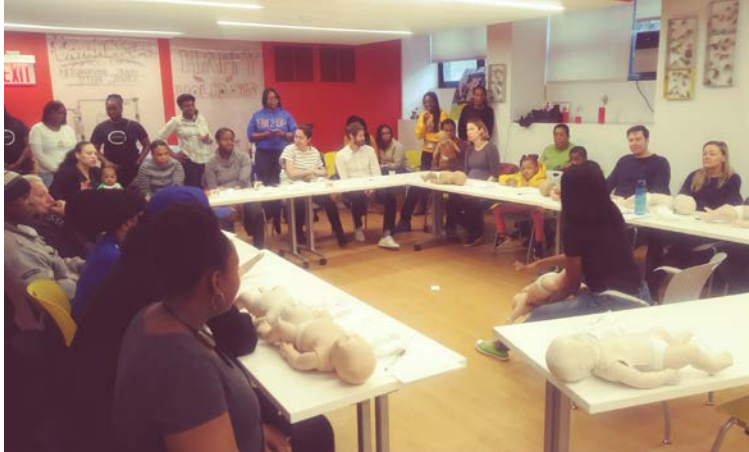
Infant Safety class at the Brownsville Health Action Center