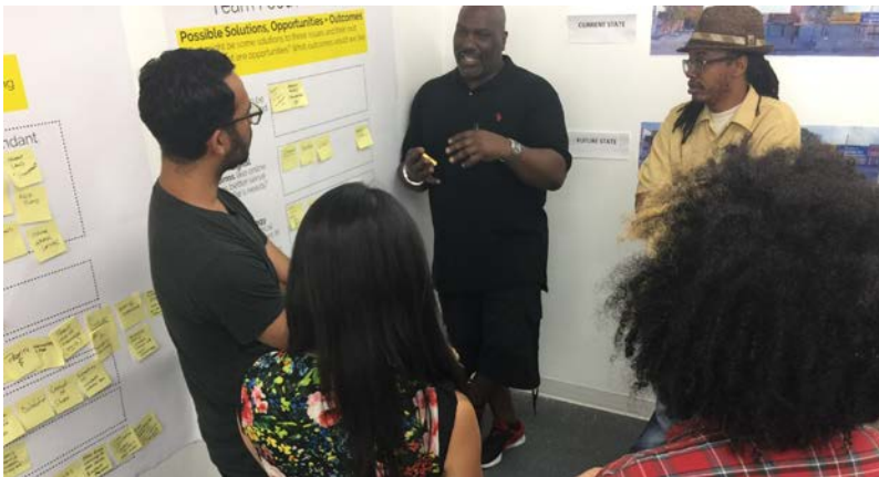
Community Tech Advisory Board Workshop.