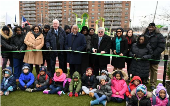
Ribbon cutting at Hilltop Playground, March 2018 (formerly Saratoga Ballfields)