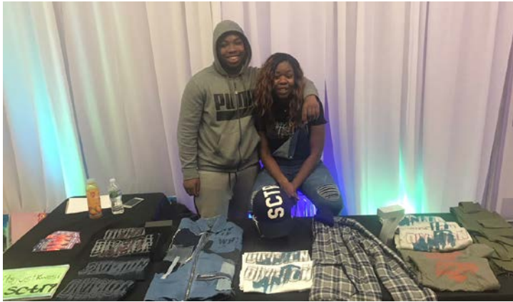
Local entrepreneurs at Be on Belmont, Dec 2017