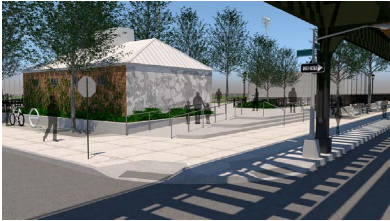
Parks without Borders schematic design at Betsy Head - DPR