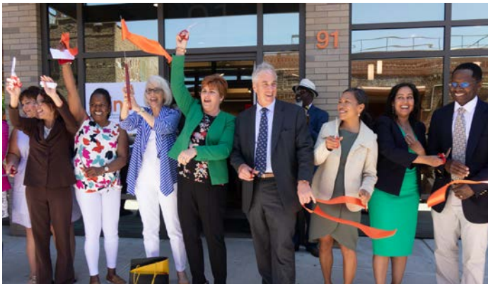
Ribbon cutting for the Stone House (WIN) permanent affordable homes for formerly homeless and/or low-income households; Jun 2018