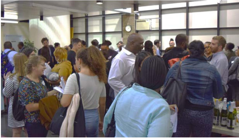
Brownsville RFP Networking Session.