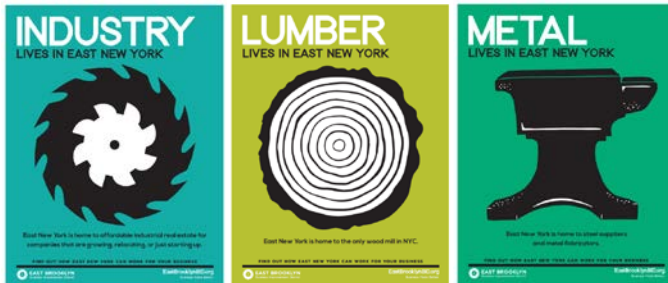
Marketing campaign posters launched in October for the East Brooklyn IBZ.