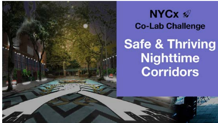
NYCx Co-Lab Challenge in Brownsville