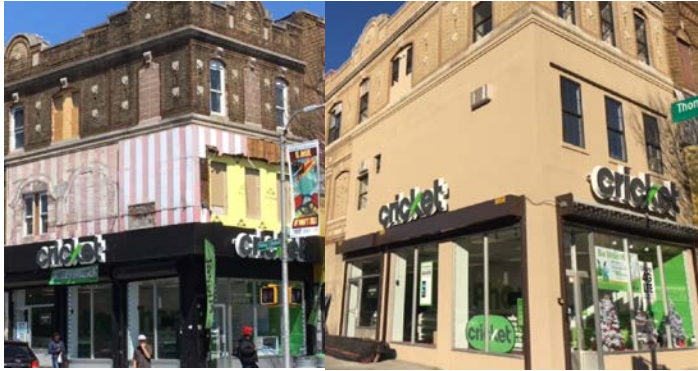
Storefront Improvements - Before and After – Dec