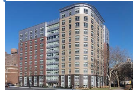
603 MOTHER GASTON BLVD