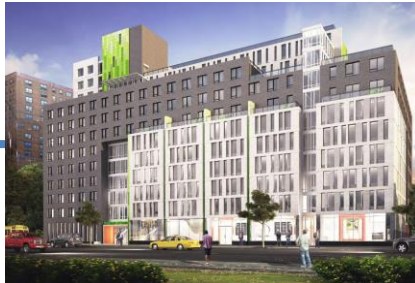
VAN DYKE III (UNDR CONSTR)