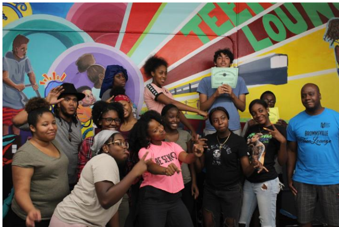
Young residents pose with new mural at the Brownsville Teen Lounge