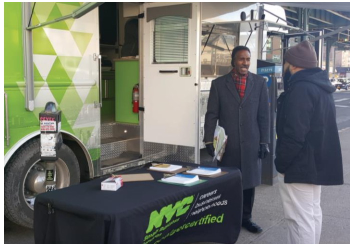
Small Business Services Mobile Unit - SBS