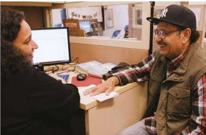
Housing Ambassador helps resident apply for affordable housing.