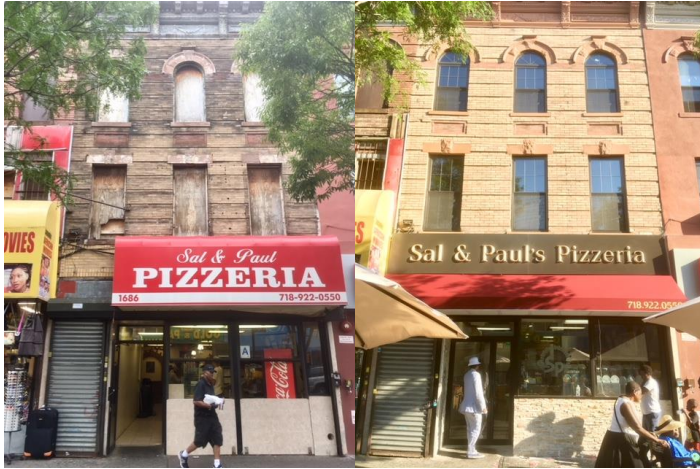
Storefront improvements of Sal & Paul's Pizzeria - SBS