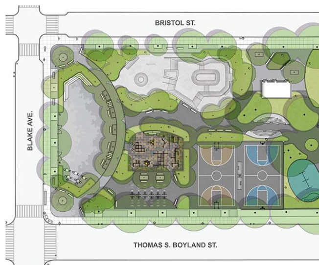
Betsy Head Park Schematic Plan