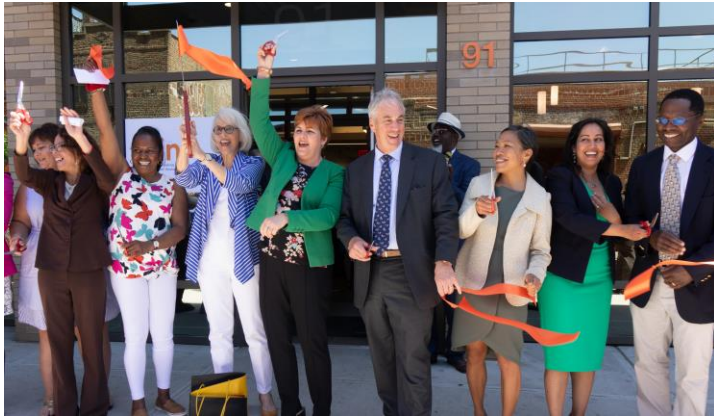
Ribbon cutting for the Stone House (WIN) permanent affordable homes for formerly homeless and/or low-income households in Jun 2018.