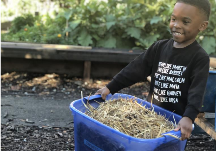
Howard Harvest Fest at Howard Houses Farm, fall 2018.