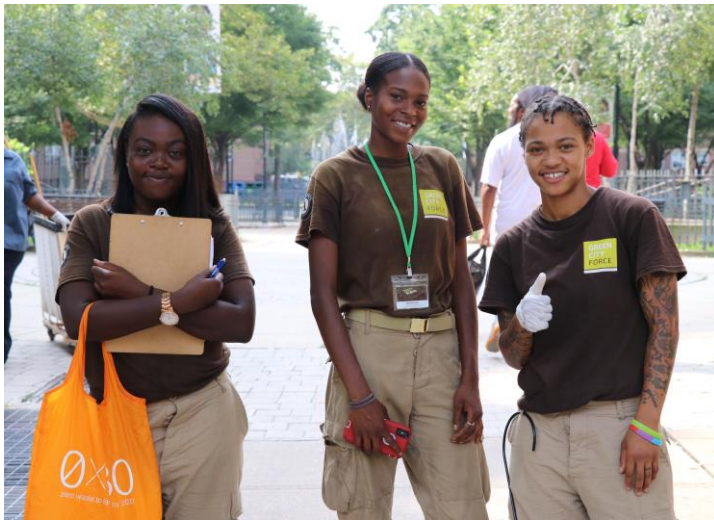
Green City Force youth in Brownsville.