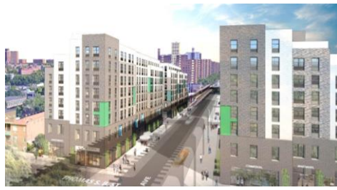
MARCUS GARVEY EXT. (POST-ULRP)