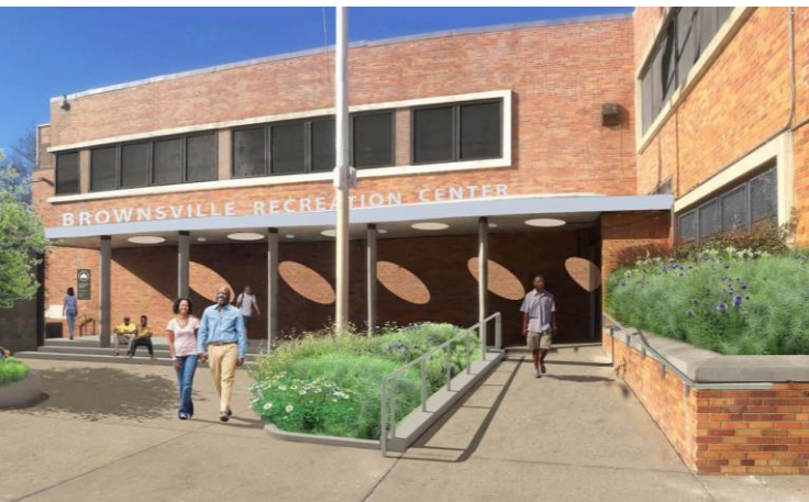
Brownsville Recreation Center (BRC) new entrance design.