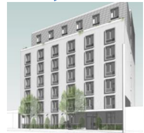
210-214 HEGEMAN (UNDR CONST)