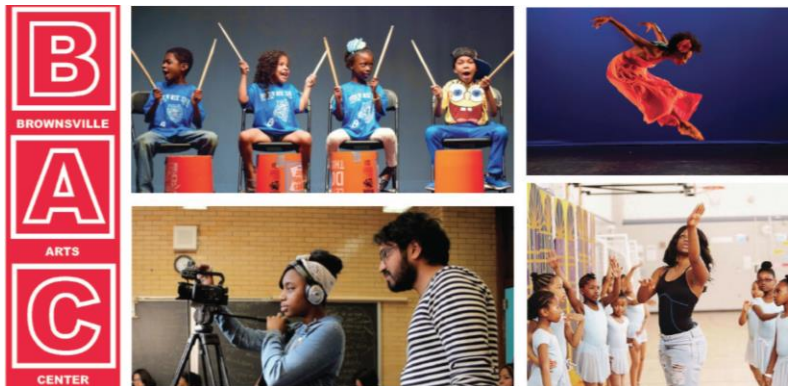
Brownsville Arts Center proposed at Rockaway-Chester RFP site. Credit: BRIC, Brooklyn Music School, Purelements, Blusea