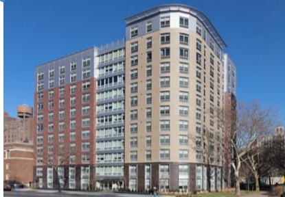
603 MOTHER GASTON BLVD (DONE)