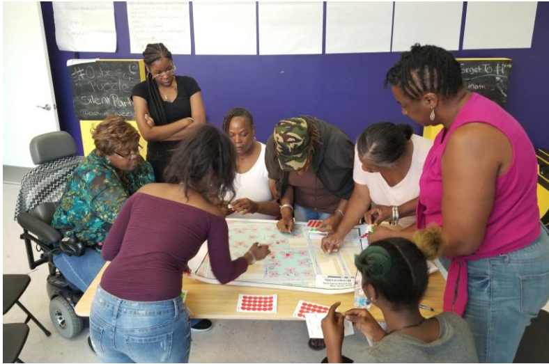
Brownsville NSTAT Meeting, fall 2018.