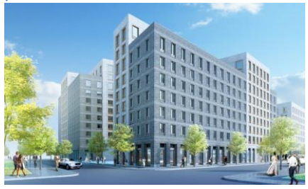
EBENEZER PLAZA (P1 UNDR CONST)