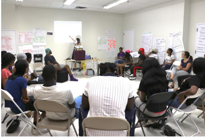
Young Innovators Pilot Program cohort - MOCTO