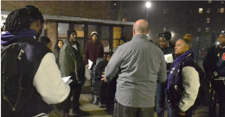
Safety Audits