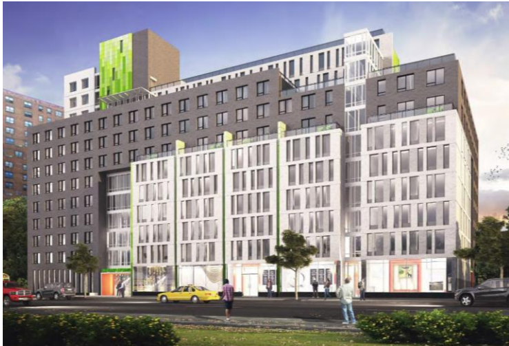
Rendering of Van Dyke III, 178 units of affordable housing with a health and wellness center operated by BMS and a daycare operated by Friends of Crown Heights, beginning construction.