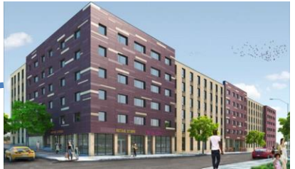
STONE HOUSE (DONE)