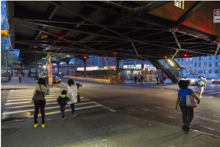
Rockaway Ave station under the elevated train - DOT