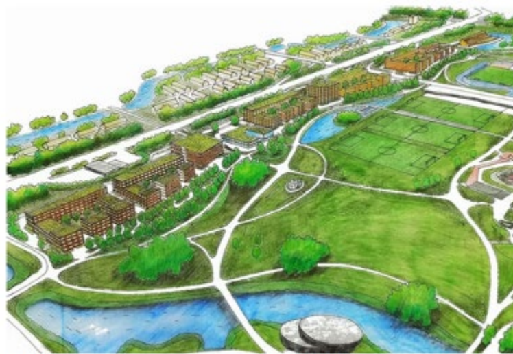
De Mandelabuurt gaat uit tien bouwblokken bestaan, waar in totaal ongeveer 2100 mensen komen te wonen.