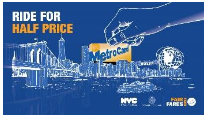
FairFares NYC 1 - Twitter 1600x900