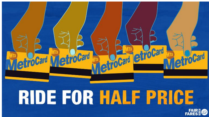
FairFares NYC 2 - Twitter 1600x900