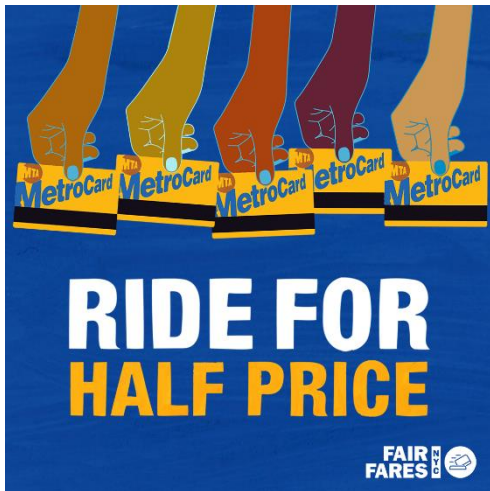
FairFares NYC 2 - FB/IG 1080x1080