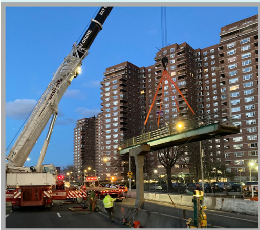
Delancey Street Pedestrian Bridge overnight dismantling on March 27, 2022