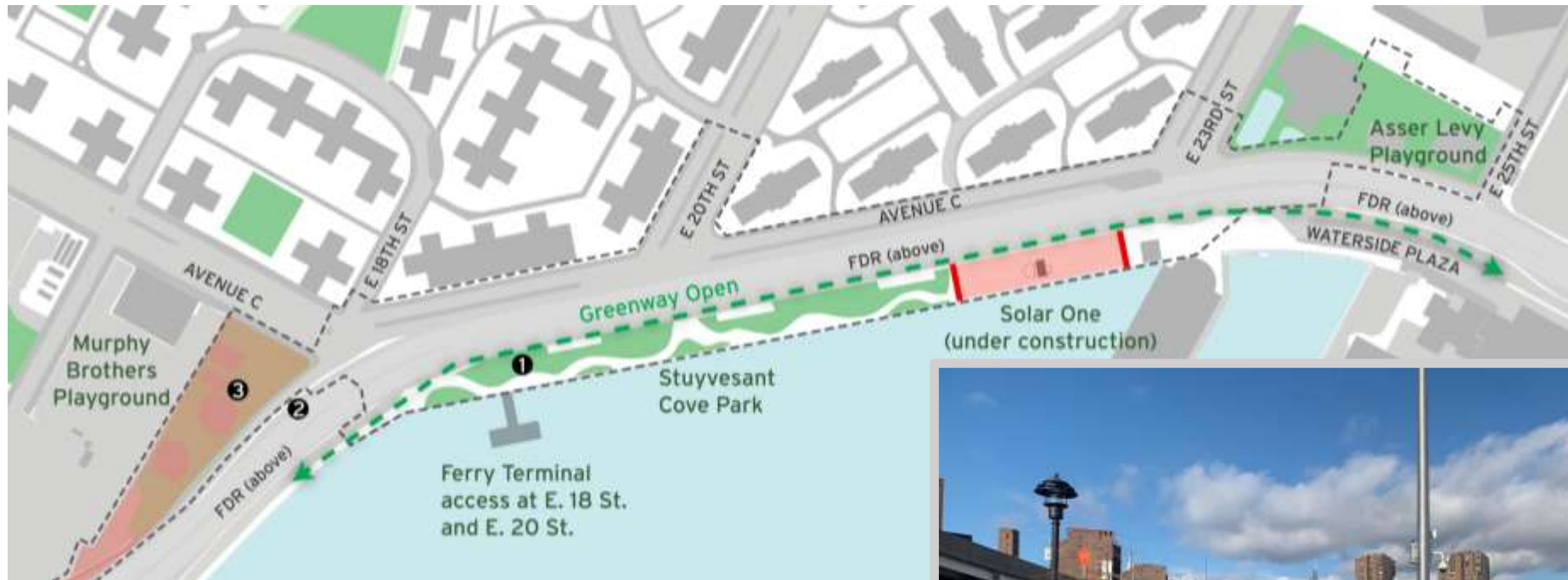
Stuyvesant Cove Park South @ E. 18 th Street entrance

information, see Advisories released for each detour/traffic pattern change posted on the website: www.nyc.gov/escr/notices