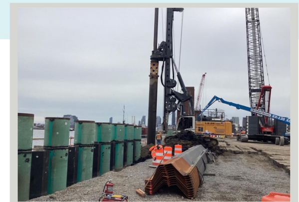
Combi-wall installation in East River Park, April 2023