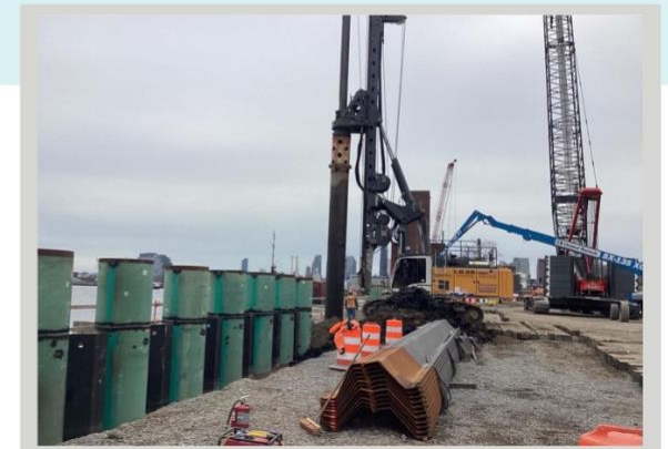
Combi-wall installation in East River Park, April 2023