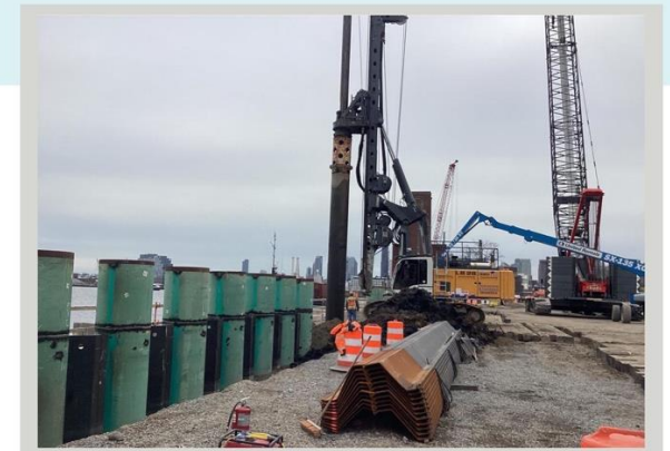
Combi-wall installation in East River Park, April 2023