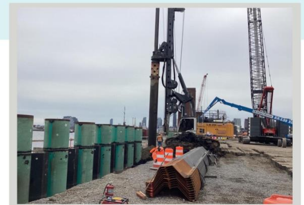
Combi-wall installation in East River Park, April 2023