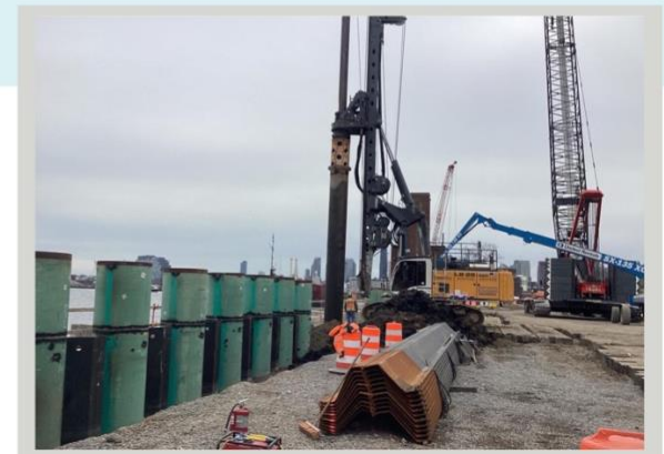
Combi-wall installation in East River Park, April 2023