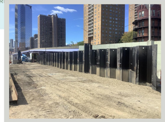
Sheet Pile for floodwall along the Greenway October 2022