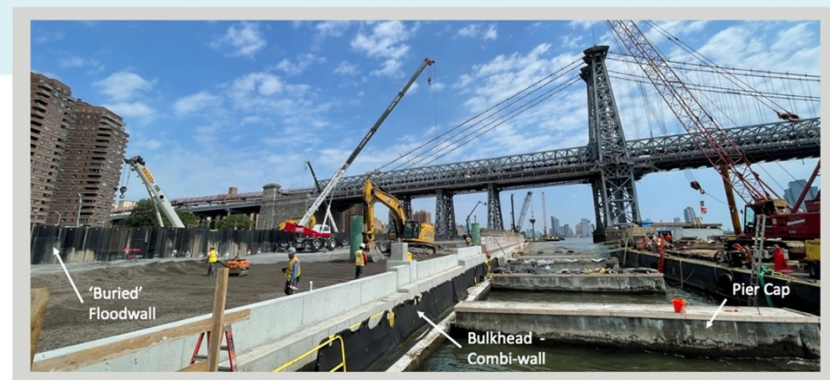
Future buried floodwall near Williamsburg Bridge, July 2023