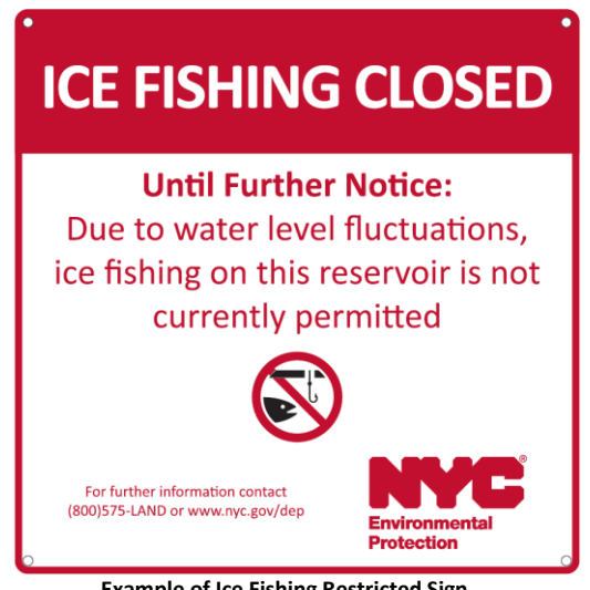
Example of Ice Fishing Restricted Sign

During the shutdown, ice fishing will be restricted on several reservoirs since water levels will fluctuate due to higher use in winter months. This fluctuation can cause a gap to form between the frozen surface and the reservoir's water level, creating unsafe conditions. Therefore, on reservoirs where this is possible, DEP will restrict ice fishing during the tunnel shutdown period. Please visit the DEP website for an updated list of reservoirs closed to ice fishing, and always obey any notices or signs posted in the field.