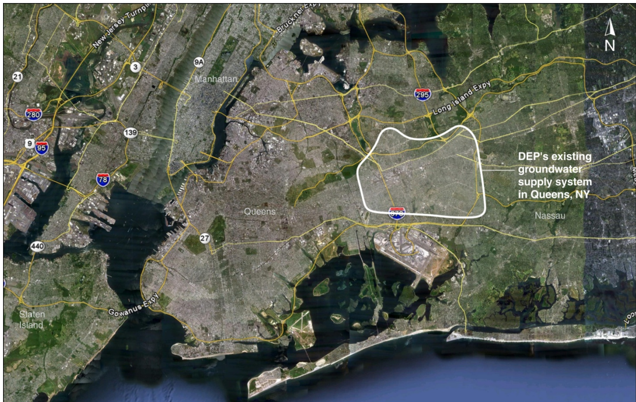
Figure 3.4-1 Queens Groundwater System

Originally owned and operated by the Jamaica Water Supply Company, the groundwater system has been owned by DEP since its acquisition in 1996. The groundwater supply system (herein referred to as the Queens groundwater system) consists of 68 supply wells at 44 well stations and several water storage tanks. Many of the wells were not active when they were acquired in 1996 due to age, deterioration of the system, and water quality issues. Most of the system has not operated in more than 10 years, but the Queens groundwater system did provide water to a limited portion of the city's distribution system until 2007.