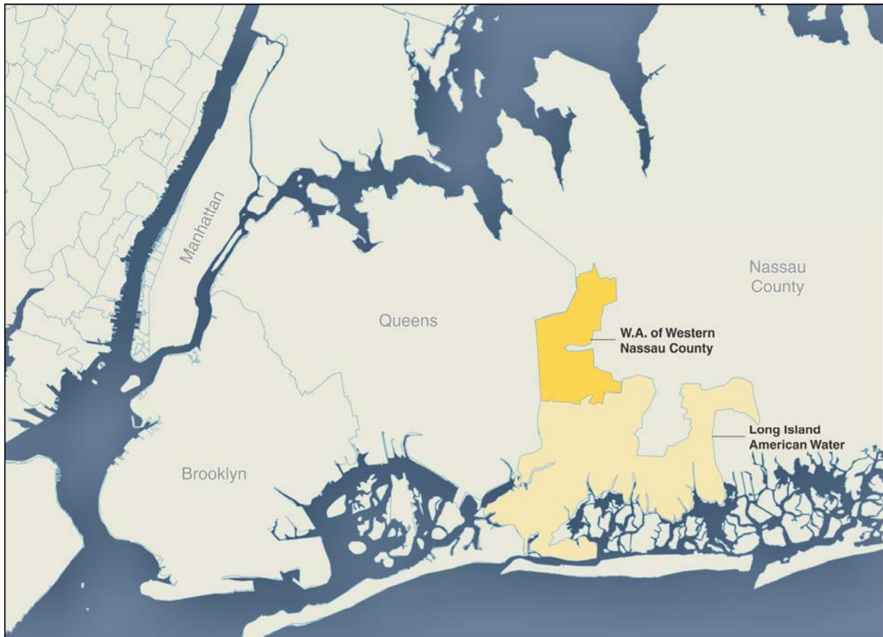
Location of Nassau County Water Districts Bordering Queens County

The NYSDEC allocates water to all New York state water suppliers through the Water Supply Permit process as administered under 6NYCRR Part 601 and for well systems, enforces pumping limits or caps on each permit issued. These permits and limits are put in-place to prevent over-pumping of the aquifer and negative interference effects on nearby wells. Under the Nassau County Interconnection project, agreements with each of the suppliers would be required and the actual quantity of water that could be made available to New York City would have to be determined following a review of the Nassau County water systems' current water production permit conditions and constraints of the existing well infrastructure.