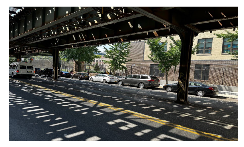
Jerome Avenue North of 196<sup>th</sup> Street (west-side of the Street)

Jerome Avenue South of 196<sup>th</sup> Street (East-Side of the Street)